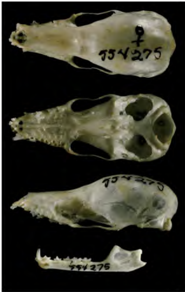
FIG. 2. Dorsal, ventral, and lateral views of cranium and lateral view of mandible of an adult male Leptonycteris yerbabuena (U.S. National Museum of Natural History [USNM] 554275) from Cochise County, Arizona. Greatest skull length is 25.9 mm.

FOSSIL RECORD. Late Pleistocene fossils are known from Cueva de La Presita, San Luis Potosí (= L. curasoae —Arroyo-Cabrala 1992; Arroyo-Cabrala and Polaco 2003). This locality is 21.4 km S of Matehuala, San Luis Potosí (23°29'37"N, 100°37'16"W) at an elevation of 1,540 m.