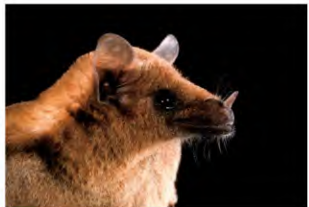
FIG. 1. Photograph of an adult female Leptonycteris yerbabuena from Mexico.

Leptonycteris yerbabuena migrates into northern Sonora and southern Arizona along 2 migration routes (Wilkinson and Fleming 1996). Lesser long-nosed bats arriving in coastal Sonora and southwestern Arizona during the spring migration travel along the western coast of Mexico. Lesser long-nosed bats arriving later in the summer to sites in south-central and southeastern Arizona and southwestern New Mexico fly along the foothills of the Sierra Madre Mountains. Migrants may travel from as far south as Jalisco (1,000–1,600 km—Wilkinson and Fleming 1996).