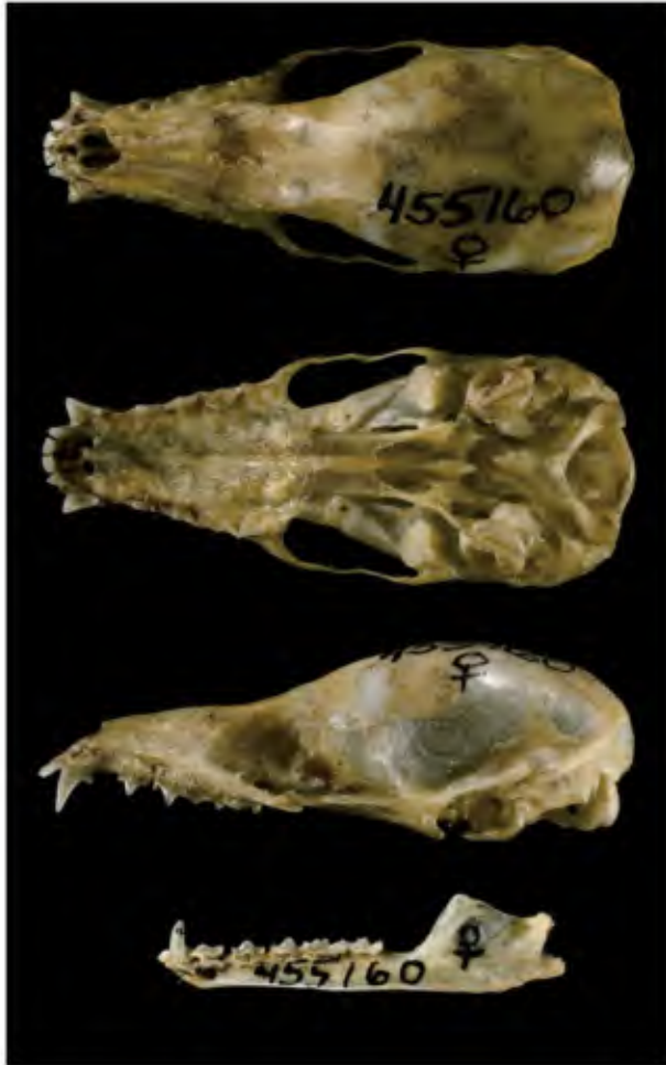
FIG. 2. Dorsal, ventral, and lateral views of cranium and lateral view of mandible of an adult male Leptonycteris curasoae (U.S. National Museum of Natural History [USNM] 455160) from Caserio Boro, 10 km N El Tocuyo, Lara, Venezuela. Greatest skull length is 26.9 mm.

orative water loss, low thermoregulation costs, and increased growth rates of young (Arends et al. 1995; Fleming and Nassar 2002). Piedra Honda Cave, Paraguaná, Venezuela, is a typical maternity cave. Annual temperature inside the cave averages 30°C and relative humidity averages 84% (Martino et al. 1998). L. curasoae co-occurs in large numbers with up to 3 species of mormoopid bats in Venezuela (Bonaccorso et al. 1992). Suitable day roosts must be within foraging range of sufficient food resources.