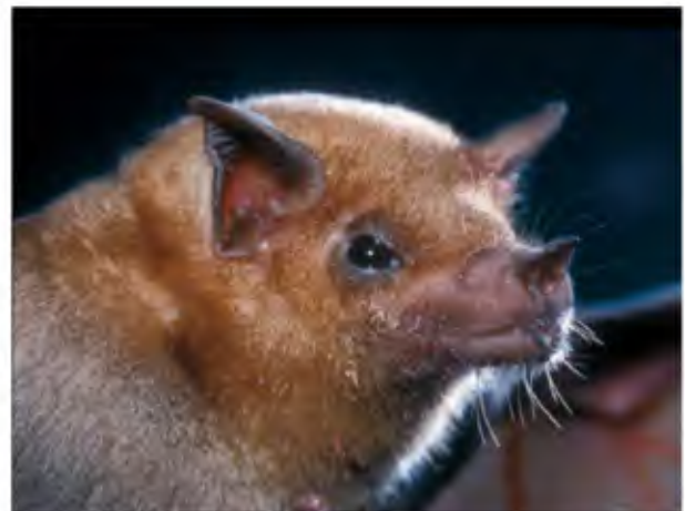
FIG. 1. Photograph of an adult Leptonycteris curasoae from Venezuela.

Typically, L. curasoae roosts in caves with varying environmental conditions, but seems to prefer caves that are hot (>30°C) and humid because they trap metabolic heat and moisture produced by thousands of conspecific and other bat species (Arends et al. 1995; Martino et al. 1998). Females gain several physiological benefits from roosting in warm, densely populated caves and mines, including lower energy expenditure during the day, reduced evap-