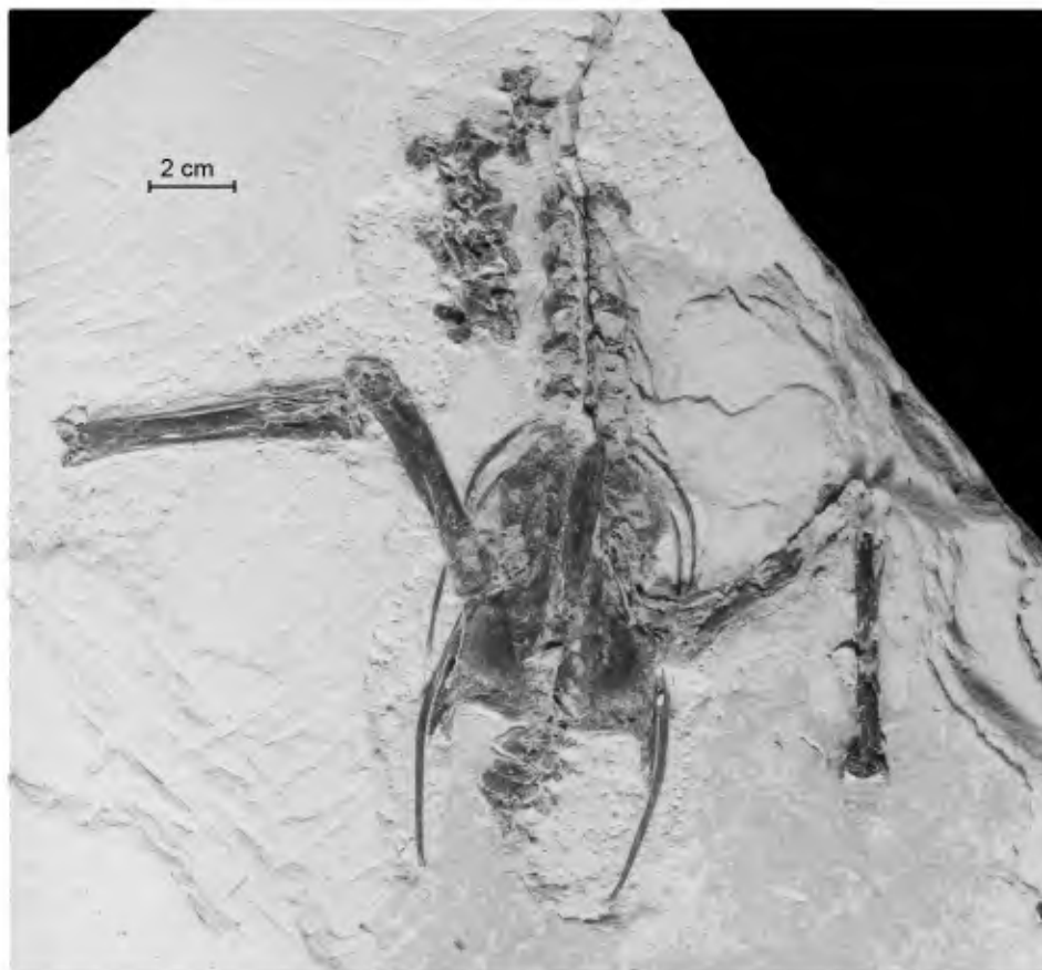
FIGURE 7. Limnofregata hasegawai , paratype, BMS E 25336 associated pelvis and hindlimbs without feet.

Paratype 2: BMS E25336, pelvis with associated right and left femora and tibiotarsi, the first 5 free caudal vertebrae, and 10 presacral vertebrae (Fig. 7). Collected by Verl and Rick Hebdon and acquired by the Buffalo Museum of Science in 1982.