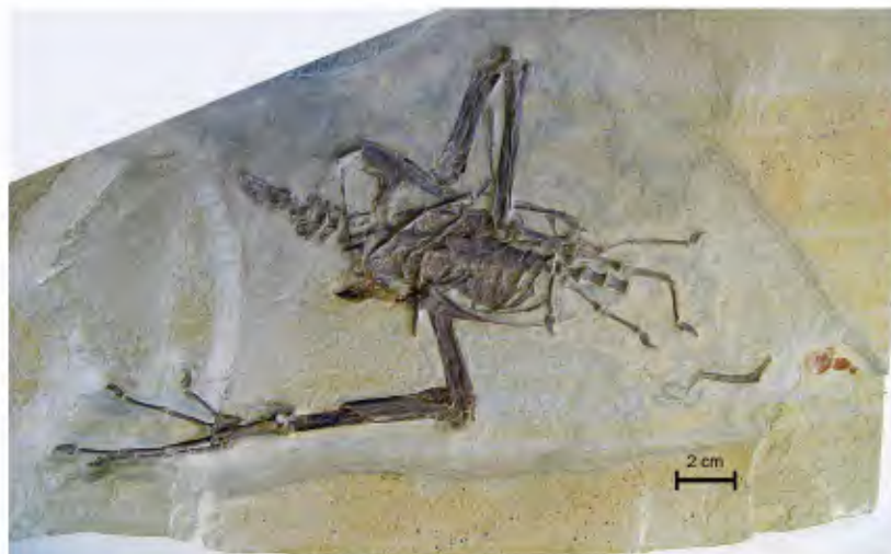
FIGURE 2. Limnofregata azygosternon , referred posterior portion of skeleton FMNH PA 723.