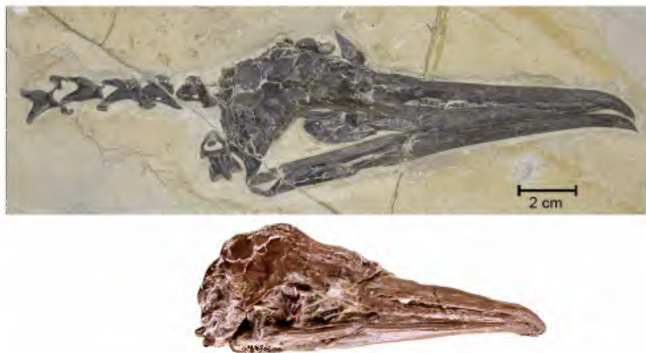
FIGURE 5. Limnofregata hasegawai , new species, holotype GMNH PV 170 (above), compared with skull and mandible of the holotype of L. azygosternon USNM 22753 (below).

Diagnosis: Much larger than L. azygosternon . Rostrum proportionately much longer, 1.6 times as long as the cranium, vs. 1.4 in L. azygosternon .