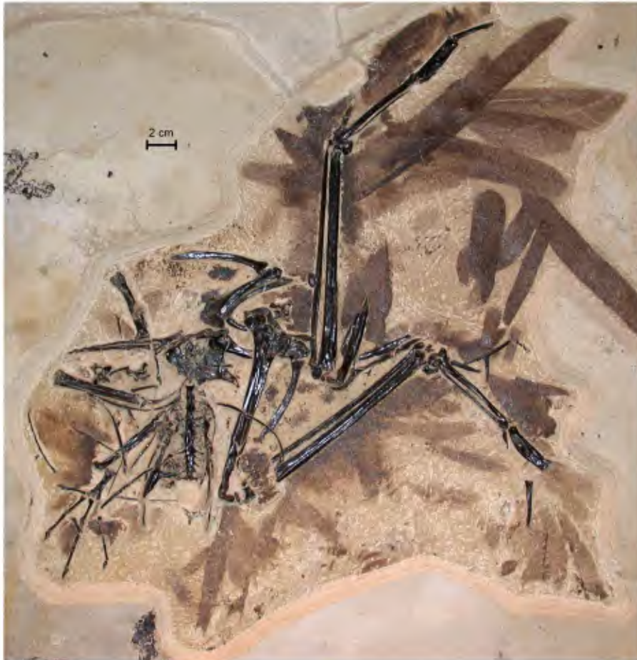
FIGURE 1. Limnofregata azygosternon , referred postcranial skeleton with feather impressions GMNH PV 167.