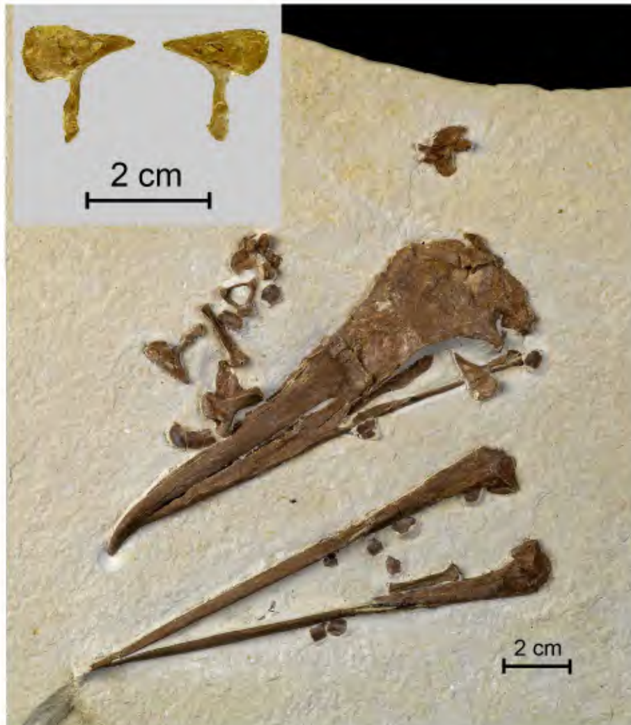
FIGURE 6. Limnofregata hasegawai , new species, paratype, FMNH PA 719, skull and mandible. Scale = 2 cm. Inset: right and left lacrimal bones showing pneumatic foramina in the corpus.