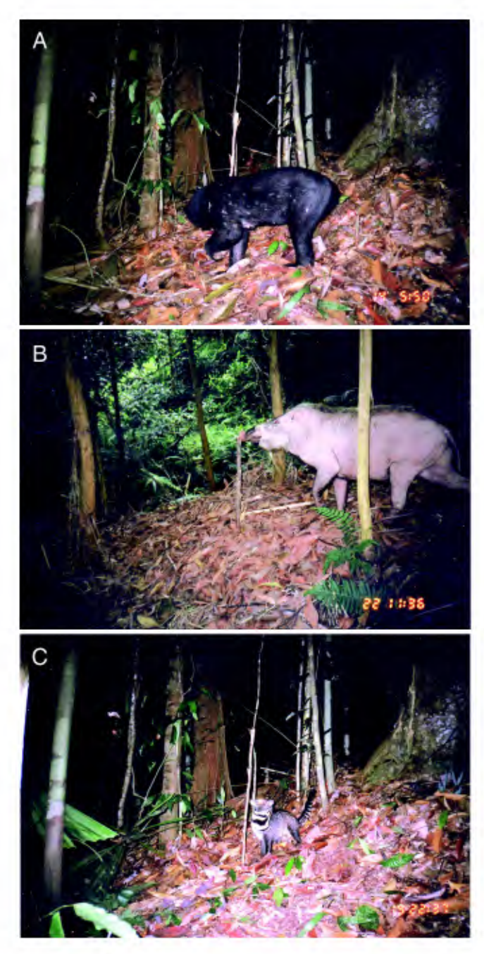
Fig. 2. Some of the photographs taken by camera during the study period showing how animals respond to a lure. A, Helarctos malayanus , Malayan Sun Bear; B, Sus barbatus , Bearded Pig; C, Viverra tangalunga , Malay Civet / Tangalung.

1). These species comprised of 15 families, and 23 genera. Approximately 64% of the total species recorded at all study sites are protected under the Sarawak Wildlife Ordinance, 1998 (State of Sarawak, 1998a, b). The species most frequently recorded was Sus barbatus (Bearded Pig) and Callosciurus notatus (Plantain Squirrel). For the Bearded Pig, a total of 12 photographs were recorded from March to July 2005. Most pigs were recorded in the late afternoon to evening, ranging from 1700 to 2000. The four pictures of Cervus unicolor (Sambar Deer) and Muntiacus atherodes (Bornean Yellow Muntjac) were photographed in the hours after midnight until early morning. Eleven species of terrestrial mammals such as Cynogale bennettii (Otter Civet), Manis javanica (Pangolin), Prionailurus bengalensis