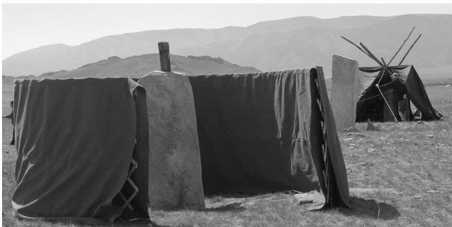
Shading deerstones with ger walls at Ulaan Tolgoi to avoid direct sunlight during the scanning process

The successful results from both DSP field seasons are encouraging for the continued use of 3D imaging in heritage conservation applications. For Mongolia's enigmatic deer stones this technology provided a safe, non-contact approach for recording in accurate detail the rare cultural evidence of Mongolia's ancient nomads. MCI conservators are now beginning the next phase of the scanning program which involves data processing. This phase will create digital graphic files that can be studied, exhibited, physically replicated and archived. Over time these records can play a pivotal role in monitoring changes in the stones and can become integral in the development of strategic plans for conservation and preservation.