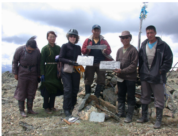
Botany Team examines carved Tibetan Buddhist plaques at the oovo on the south peak of Renchinkhumbe Mountain.