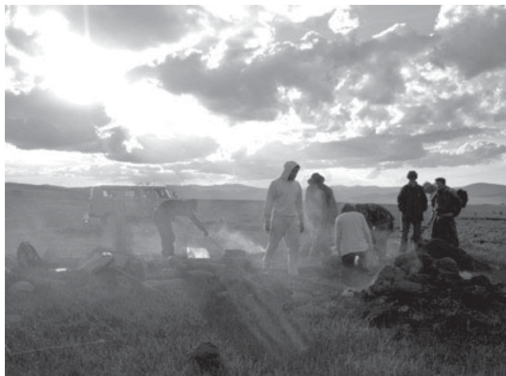
Excavations in 2006

Deer stones are the lesser part of the Bronze Age landscape one encounters while traveling across the steppes of northern Mongolia. Even more striking are the thousands of conical boulder mounds that rise above the grassy plains, mimicking equally numerous piles of eroding bedrock that may have been the original inspiration for these gateways to the gods. One cannot pause before these crumbling extrusions of earthly crust without imagining that they, and the hills and