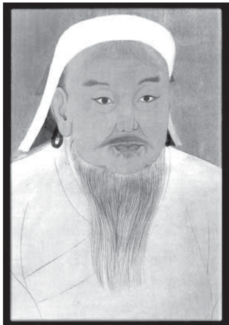
Portrait of Chinggis Khaan

In 1921 Mongolia underwent a communist revolution with the aid of Bolshevik forces in Siberia, and became a loyal Soviet satellite from 1924 to 1990. The communists destroyed the Buddhist monasteries and purged the country of intellectuals and lamas, in their drive to establish a secular state. Chinggis Khan was banished from the history books. Although there were diplomatic and commercial contacts in the early part of the 20 th century between the United States and Mongolia, full diplomatic recognition did not occur until 1987. During these socialist years, Mongolians and Americans knew little about each other. However, Mongolia did experience a few notable cultural contacts with Americans: The Roy Chapman Andrews dinosaur expeditions in the 1920s, the travels in the 1930s of the eminent