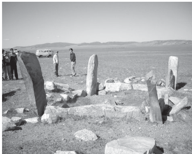
Deerstones were repurposed in "square burials" by a later culture

Mongolia's central location in Inner Asia also called for studies investigating historical links between it and neighboring