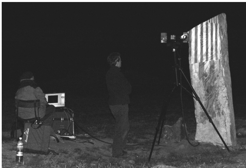
Laser scanning a deer stone at night

stone surface, the hand-held scanner would emit a single laser line, used by the camera and computer components to triangulate the details of the surface in 3D space. In 2006, a Breuckmann GmbH TriTos structured light scanner was used to scan 14 deer stones and several stone fragments at Ushkiin Uver. The MCI conservators also completed a full scan of the tallest known deer stone (ca.4m) at the site of Ulaan Tolgoi. The structured light scanner projects a