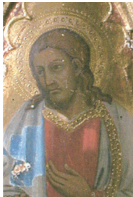
Figure 1 Brighter future? This fourteenth-century icon, held at the National Gallery of Siena, Italy, has become dulled over time. Tests on a small area (not shown) by Carretti et al. 1 suggest that 'reversible' gels could be effective cleaning agents that would not damage the artwork.

In recent years, a number of gelled reagents have been introduced 3 . These polymer-based materials make it easier to