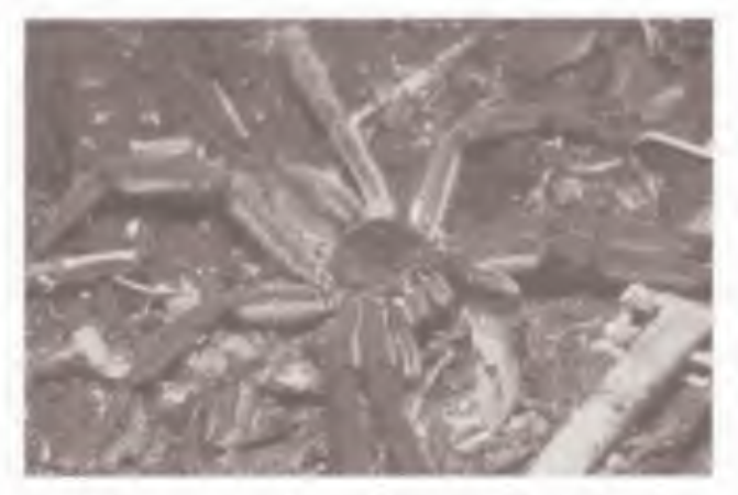
FIGURE 3 Spider (Araneae: Ctenidae, Cupiennius sp.) (photograph by Jonathan A. Coddington).

Araneae is the second largest arachnid order with 108 families, 3200 genera, and approximately 37,000 species described (second to mites). Spiders are distinguished from other arachnids by their silk-producing spinnerets at the end of the abdomen and the prosomal poison glands exiting through their chelicerae modified as fangs (Fig. 3). Spiders are among the very few animals