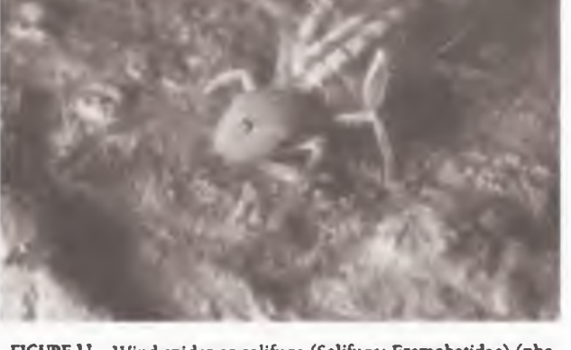
FIGURE 11 Wind spider or solifuge (Solifuga: Eremobatidae). See also color insert, this volume.

Since we sometimes find them on ourselves and our pets, because they are relatively large, and because of their role as serious vectors of human disease, the ticks are probably the most familiar group of mites. In fact, ticks (which have their own name only because of their