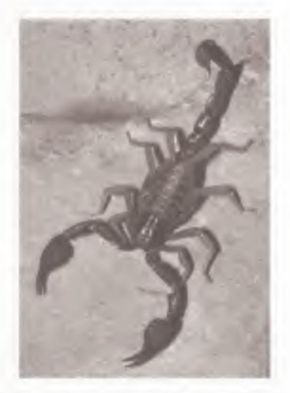
FIGURE 4 Scorpion (Scorpiones: Vaejovidae, Uroctonus sp.) (photograph by James C. Cokendolpher). See also color insert, this volume.

About 1256 species of scorpions are currently known in 156 genera and 18 families (Fig. 4). Scorpions are one of the better collected arachnid groups so that huge