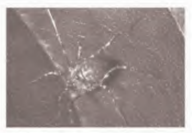
FIGURE 5 Harvestman (Opiliones: Phalangiidae, Hadrobunus sp.) (photograph by Jonathan A. Coddington).

The described world fauna of Opiliones (harvestmen or daddy long legs) comprises approximately 44 families, 1554 genera, and about 5000 species (Fig. 5). The largest harvestman is Trogulus torosus at 2.2 cm long. The anterior and posterior body regions are broadly joined and the abdomen is rather short, giving the body a wider and rounder appearance than those of other