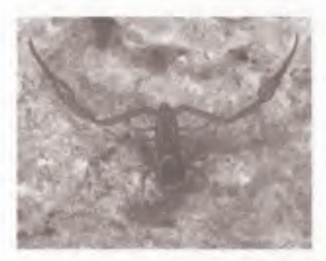
FIGURE I0 Pseudoscorpion (Pseudoscorpiones: Neobisiidae, Tartarocreagis infernalis (Muchmore).