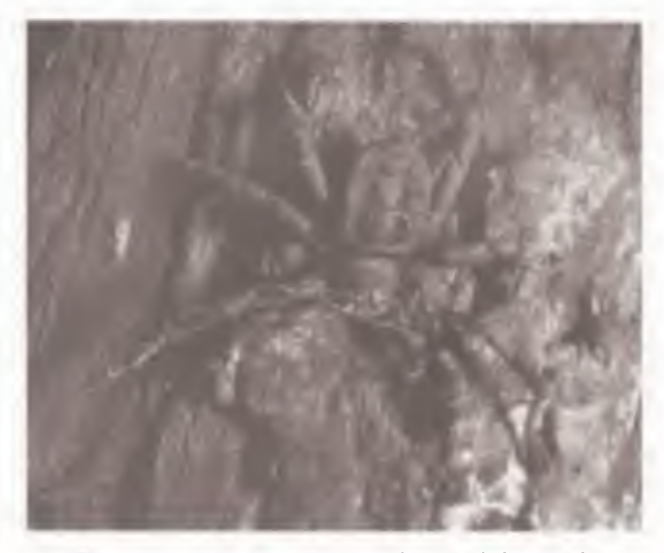
FIGURE 9 Ricinuleid (Ricinoididae). See also color insert, this volume.

About 3100 species of Pseudoscorpions (or "false scorpions") have been described, classified in approximately 430 genera, 24 families, and two suborders (Epiocheirata and locheirata) (Fig. 10). The North American fauna comprises about 350 species. One local fauna in the Amazon comprised nine species and Mediterranean ecosystems around Perth, Australia, and other Old World tropical moist ecosystems are comparable (M. Harvey, personal communication). Pseudoscorpions look like tiny scorpions without the tail and pectines. Colors are tan to dark brown or black. Their chelate pedipalps can have venom glands and the chelicerae have silk glands. The largest is Garypus titaneus at 12 mm long, but most are 2 or 3 mm. They are flattened for life in crevices, usually under bark or in leaf litter, but a few forms live on ocean shores where they are truly intertidal. Numerous species live among the hairs of mammals where they feed upon other arthropod parasites. At least one species has the body, legs, and palps modified for living on a Celebese rat. Chelifer cancroides is cosmopolitan and lives in houses where it hunts book lice and other small insects. Pseudoscorpions are sometimes found in aggregations of dozens of individuals. Reproduction, as in most other arachnids, is via a spermatophore. The female builds a silken nest