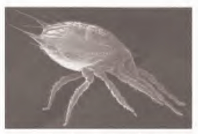
FIGURE 13 Parasitic sejine mite (Acari: Sejiidae, Epicroseius sp.).

Parasitic and phoretic mites exploit most terrestrial vertebrate species, most other arthropod groups, mollusks, and even marine invertebrates (Fig. 13). Most species of birds, for example, generally support many "feather" mite species found nowhere else. Four or five different, host-specific species inhabit different feather