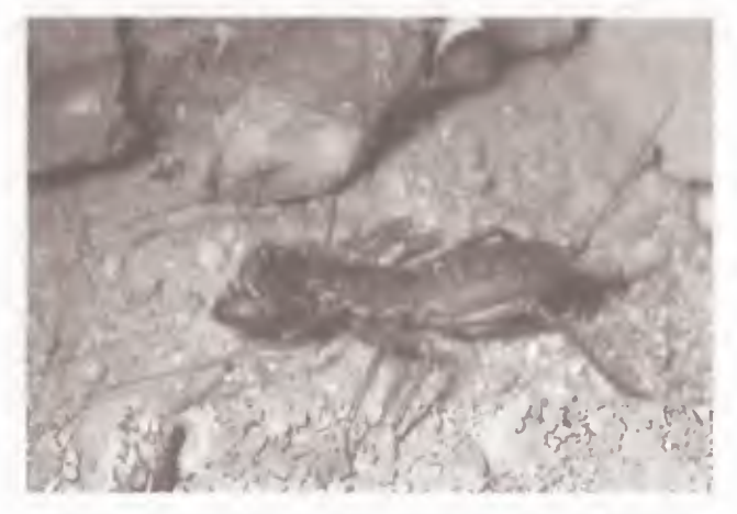
FIGURE 7 Whip scorpion (Uropygi: Thelyphonidae, Mastigoproctus sp.). See also color insert, this volume.

Uropygids are tropical to subtropical animals. They hide in leaf litter, burrows, under logs and rocks, and inside dark crevices or holes during the day, emerging