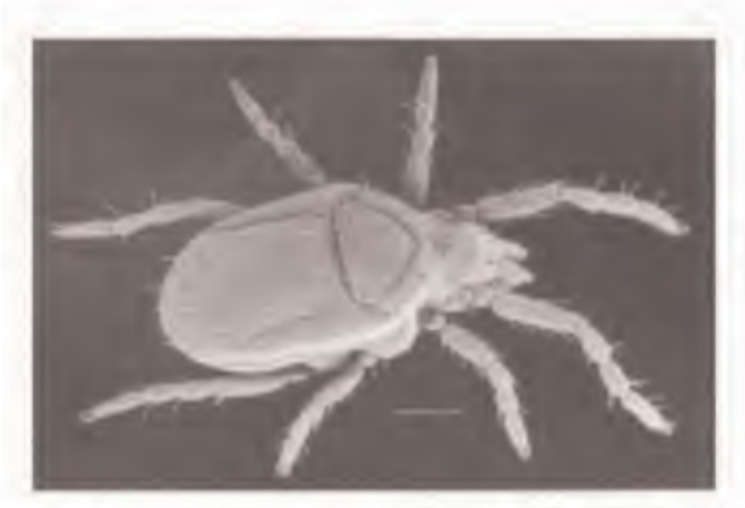
FIGURE 12 Free-living yellow moss mite (Acari: Penthalodidae, Stereotydeus sp.) (scale bar = 100 \mu m).