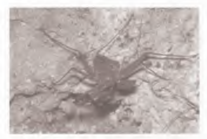
FIGURE 6 Whip spider or tailless whip scorpion (Amblypygi: Phrynidae, Phrynus sp.). See also color insert, this volume.

Approximately 125 species of amblypygids in 20 genera and 5 families are known (Fig. 6). The American Acanthophrynus coronatus is the biggest, at about 4.5 cm in body length. The usual adult body size is about 4-6 cm. The first walking legs of amblypygids are enormously long, and fully stretched a large animal can span 50 cm. Whip spiders have no tail, and their pedipalps are modified into fierce-looking, spiny raptorial appendages. Amblypygids are easily recognized by their extremely long front legs and raptorial pedipalps. Colors are dull brown or black. The body is flat and leg insertion twisted so that limbs fold in the same plane as the body (like a crab), permitting the animals to edge through thin openings such as cracks in hollow trees. They move sideways more easily than forward or back. Amblypygids hunt by drifting their long front legs gently over the surface around them to locate prey and using their raptorial pedipalps to pounce. Like spiders, all the abdominal ganglia have migrated into the prosoma in which, fused, they form a brain. Reproduction is via a spermatophore. Like uropygids, amblypygid females carry their egg clutches inside a membrane of dried mucus glued to their ventral abdomens. The 15-50 young hatch and remain inside this membrane until they have undergone their first molt. The young cling to the mother for a short time.