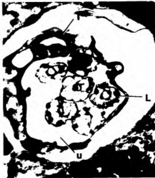
FIGURE 4. Cross-section of gravid female Protractis sp. in large intestine of a red-footed tortoise. Note numerous larvae within uterus. i, intestine; l, larva; u, uterine lumen (AFIP MIS #83-6526). H&E, \times 630 .

Attempts to treat protractid infections with ivermectin have yielded inconclusive results (Teare and Bush, 1983) and subsequent limited trials reported in the present study with piperazine citrate and fenbendazole were ineffectual in controlling this parasite. Further research is needed to clarify the possible efficacy of other available anthelmintics against this parasite. Even if complete elimination of Protractis is not possible, reducing the intensity of infection with anthelmintics may allow restoration of a commensal relationship.