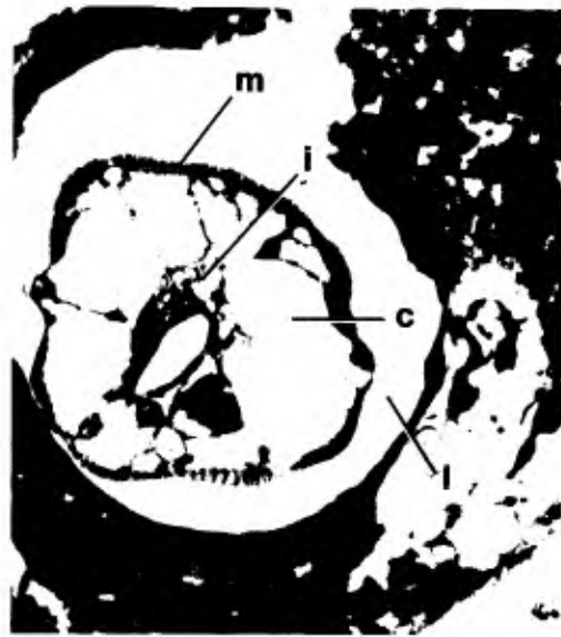
FIGURE 3. Cross-section through posterior end of female Proatractid sp. in large intestine of a red-footed tortoise. c, lateral chord; i, intestine; l, lateral ala; m, platymyarian musculature (AFIP MIS #83-6525). H&E, \times 630 .

Reptiles are hosts for a wide variety of protozoan and metazoan parasites and the numbers of parasites are often high (Frank, 1981; Marcus, 1981; Frye, 1981). Oxyurid pinworms are among the most common parasites found in tortoises (Marcus, 1981), however, most authors consider them non-pathogenic (Telford, 1971;