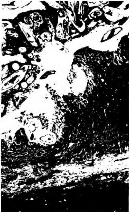
FIGURE 2. Large intestine of red-footed tortoise with numerous Proatractis sp. embedded in necrotic mucosal plaque (AFIP MIS #83-6527). H&E, \times 60 .

cephalus sp. were detected also on an antemortem fecal exam in several tortoises.