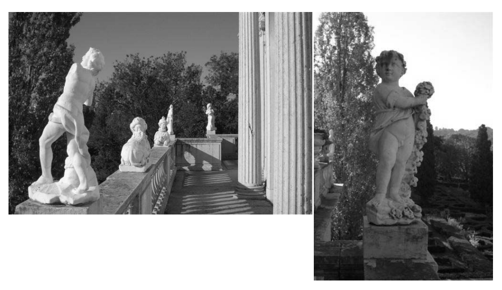
Figure 5: Statues on the terrace balustrade treated with an aqueous emulsion of an oligomeric siloxane after cleaning in 1999. On the left, one of these statues shows development of bio-colonization on the more exposed head. Photos 2007.

The long-term project being developed for the stone statues in the gardens of the National Palace of Queluz has allowed to evaluate the performance of oligomeric siloxanes based water repellents, both in solution as well as in aqueous emulsion.