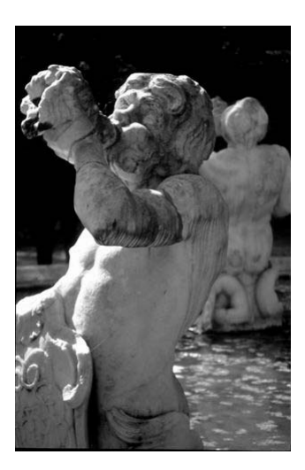
Figure 2: Particularly noticeable is the streaking under the arm of the Trion resulting from uneven biocolonization. The marble statues are in a fountain that had been cleaned and treated with a water repellent four years previous to the photograph date.

Interestingly, the four figure pairs belonged to a group of six pairs which decorate a balustrade that limits the formal Malta garden by the palace. The record compilation showed that the other two pairs had been treated by a different conservation firm, using the same water repellent, at about the same time (1997). Curiously, these two pairs showed the streaking effect to a far lower degree, as shown in Figure 3. However, the more exposed areas were far darker from heavier biocolonization.