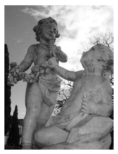
Figure 3: Note the difference in streaking from the putti pair on the left treated in 1996/7 and that on the right, treated by a different conservation firm in 1997. Photographs taken in January 2003. Note the difference in biocolonization distribution, streaked on the left and less streaked though more intense in some areas on the group right.

As mentioned above, the two putti groups (Figure 3) are located close to each other, have similar environmental exposure, were cleaned at practically the same time and the same water repellent was applied by brushing, Nevertheless, a different re-colonization pattern developed, suggesting, by the fact that the second group had heavier colonization on the most exposed areas as occurs normally on untreated objects, that these had received a lower amount of water repellent. This would suggest that the streaking pattern is enhanced when more water repellent is applied.