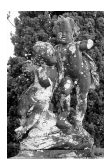
Figure 1: Appearance of a Putti group before the intervention in 1996/7. Note the dark soiling resulting from biocolonization. This same group is shown in Figure 3 some years after cleaning.

interventions have been documented with a written report. And when there is a written report, it generally does not provide sufficient detail so as to be able to understand how the actual intervention was carried out. Unfortunately, this is yet one of the most unsatisfactory issues in conservation [3].