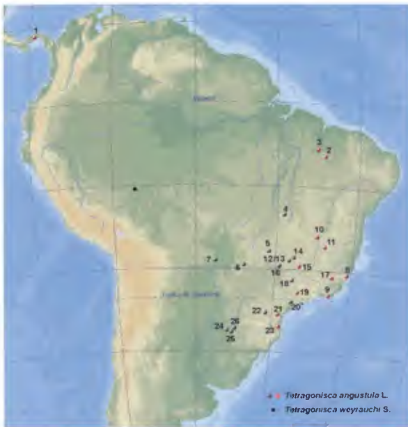
Figure 2 - Geographic distribution of the two T. angustula clusters: Group 1 (red) includes: 1- Panamá, 2- Mirador, 3- Barra do Corda, 8- Domingos Martins, 9- Maricá, 10- São Francisco, 11- Bocaiúva, 15- Araxá, 17- Canaã, 19- Pedreira, 21- Curitiba and 23- Blumenau. Group 2 (black): 4- Porangatu, 5- Rio Verde, 6- Campinópolis, 7- Ladário, 12 and 13- Uberlândia, 14- Grupiara, 16- Campina Verde, 18- Ribeirão Preto, 20- Pilar do Sul, 22- Prudentópolis, 24- Posadas, 25- Aristóbulo del Valle, and 26- Cerro Azul. The asterisk indicates the sample collected from a three-year-old colony from Pilar do Sul which had been maintained for three years prior to sampling in Ribeirão Preto.

The occurrence of T. a. fiebrigi could be the result of intraspecific hybridization. In our RAPD marker study there was only one possible intraspecific hybridization event, which can be seen in Figure 2 where the Pilar do Sul genotype (allocated to group 2 ( T. a. fiebrigi ) by our RAPD analysis) appears to be introgressing into group 1 ( T. a. angustula ). As explained in the materials and methods, the Pilar do Sul colony (morphologically T. a. angustula ) was actually in Ribeirão Preto where it had been maintained for three years prior to sampling while the other colony sampled (also morphologically T. a. angustula ) had always been in Ribeirão Preto, and it may have been that intraspecific hybridization occurred between these two colonies to produce T. a. fiebrigi . Intraspecific hybridization would be expected to result in co-dominant bands but this did not occur in this case, probably because RAPD markers usually yield dominant bands. Another way of demonstrating intraspecific hybridization would be by monitoring the introgression of RAPD markers in haplodiploid crossings, which also was not the case. However, Castanheira (1995) has demonstrated that rare alleles have been constantly introduced into the Ribeirão Preto T. a. angustula population due to importation of colonies of bees from other sites by beekeepers and researchers, isozyme markers of T. a. fiebrigi having been found in natural populations of Ribeirão Preto bees.