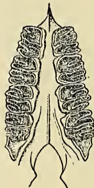
FIG. 4. PALATE OF DACTYLOMYS TYPUS [= D. DACTYLINUS], COPIED FROM REVUE ET MAG. DE ZOOL., 1852, NATURAL SIZE

middle dorsal area." The skull of boliviensis is smaller than that of d. canescens , Thomas's measurement of upper tooth-series being 21.5 mm. as against a length of 17.7 in boliviensis .