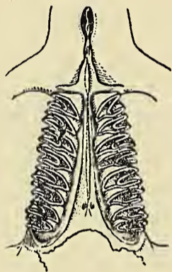
FIG. 3. PALATE OF DACTYLOMYS DACTYLINUS, No. 34594, NATURAL SIZE

Dactylomys dactylinus canescens , described by Thomas in the Annals and Magazine of Natural History for 1912, page 87, is of the dactylinus type with "rusty color of under fur strongly marked along the