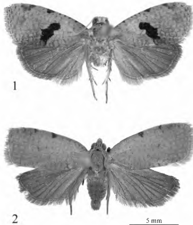
Figs. 1–2. Male and female of Xenothictis gnetivora . 1, Male, 2, Female.

new species, provide descriptions and illustrations of adult facies, male and female genitalia, and immatures, and to present a list of the described species of the genus. Although considerable material, including other new species, has accumulated in major museums worldwide, it is not within the purview of this paper to review this information or describe additional new species. We have not seen any other species of Xenothictis from New Guinea.