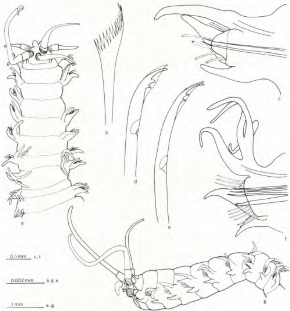
Fig. 1. Onuphis (Onuphis) difficilis holotype, N.M.H.N., Montevideo, I 1382: a, Anterior end, dorsal view; b, Pectinate seta, median parapodium; c, Third parapodium, anterior view; d, Large hook, third parapodium; e, Pseudocompound hook, third parapodium; f, Eighth parapodium, anterior view; g, Anterior end, lateral view.

Ventral cirri (Fig. 1g) are cirriform in the first 8 setigers and postsetal lobes are distinctly digitiform in the first 17 setigers in the holotype and in the first 11 or 23 setigers in the 2 paratypes. The first parapodia are no longer than those in the second or third setiger (Fig. 1c). In each of these parapodia the acicular lobe is distally rounded, the presetal lobe follows the outline of the acicular lobe closely except on the lower side where it is cut away from the base of the setae. A distinct contraction fold is present across the middle of the frontal face. The ventral cirrus and postsetal lobes are both triangular and of the same size. The dorsal cirrus is more distinctly digitiform and twice as long as the ventral cirrus. The ventral cirri and postsetal lobes become increasingly tapered posteriorly (Fig.