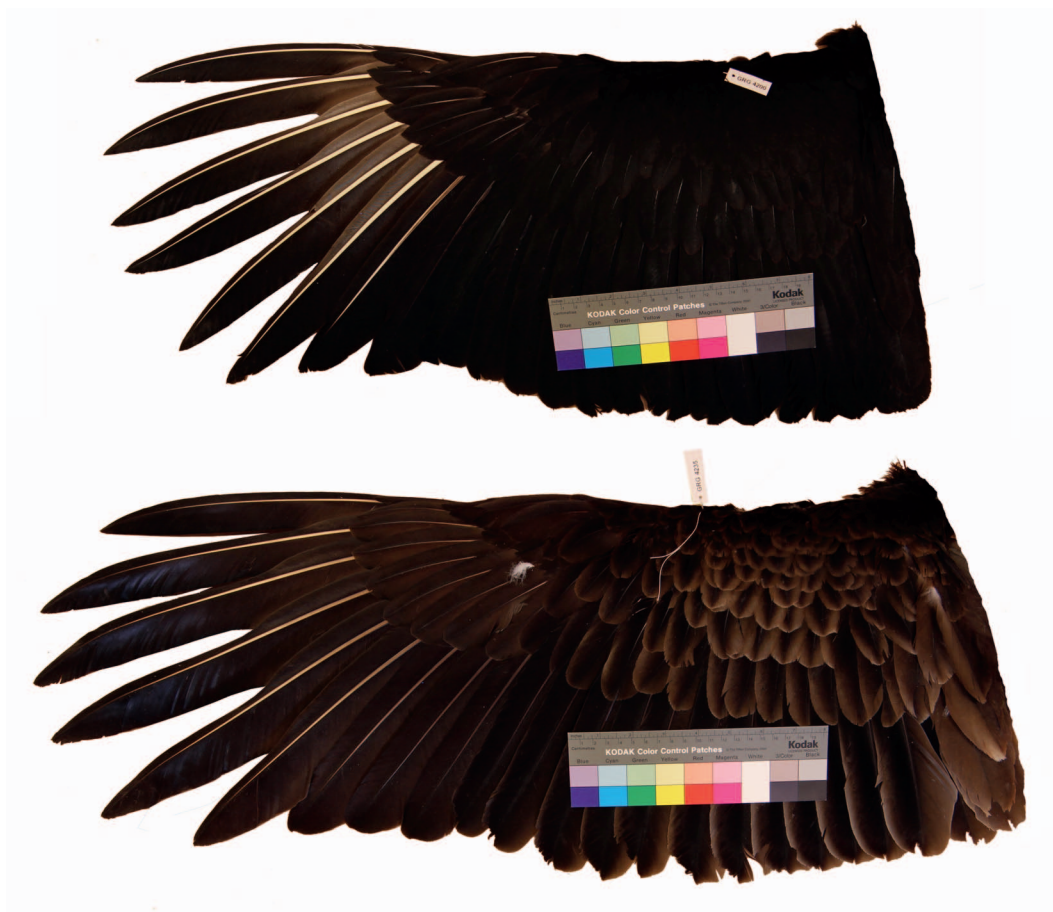
Fig. 1. Spread wings of Black Vulture (top) and Turkey Vulture (bottom). Both examples exhibit the pointed primary tips and narrower more pointed primary wing coverts typical of immature birds.

across the back. The chord of the root box (leading to trailing edge) was equivalent to the greatest wing width. Wing aspect ratio was defined as the wing span squared divided by wing area (Pennycuick 2008). A low wing aspect ratio indicates relatively short and broad wings whereas a high aspect ratio indicates long and narrow wings.