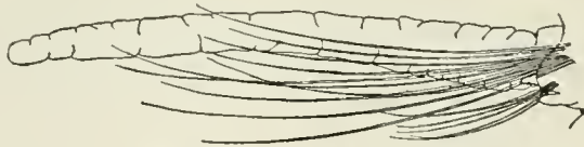
Ammotrypane brevis .—Parapodium and gill from somite X, \times 56 .

The type of this species is a somewhat contracted specimen 15 mm. long, 1.5 mm. broad and 1.9 mm. high in the middle, being therefore rather robust and tapering to both ends. The general resemblance to A. aulogaster is close, but if the differences exhibited by the single specimen prove to be constant the two species are readily separated.