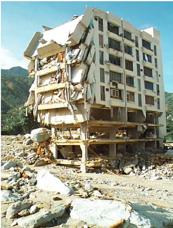
Figure 4. Apartment buildings damaged by debris flows and flash floods, 1999, Caraballeda, Vargas, Venezuela.