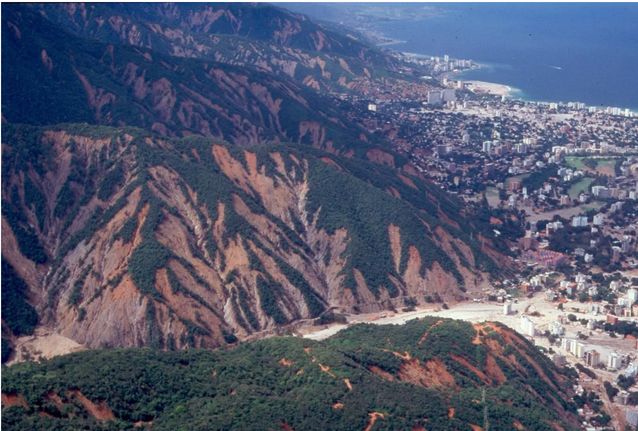
Figure 6. Vargas state, Venezuela, view to east along Caribbean coast showing landslide scars and a series of highly developed alluvial fans at the mouths of multiple stream channels at Sierra de Ávila mountain front. Photo source: M.C. Larsen, January 2000.