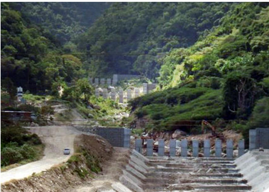
Figure 7. Concrete-lined stream channel emerging from mountain front, Sierra de Ávila, Vargas, showing vertical barriers designed to reduce transport of debris flow material onto downstream alluvial fans.