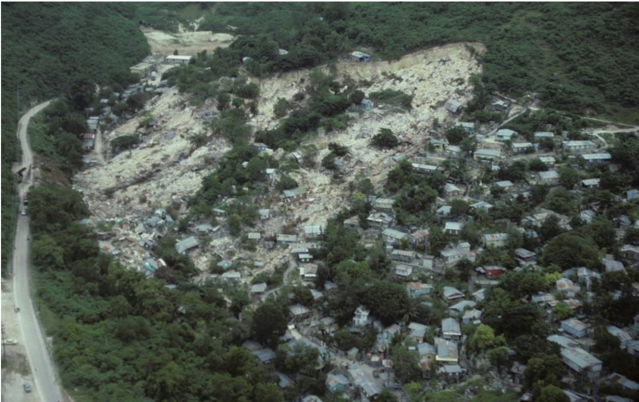
Figure 3. Unplanned community on steep unstable bedrock, Barrio Mameyes, Ponce, southern Puerto Rico. Hillslope failure killed 129 people (Jibson, 1989).