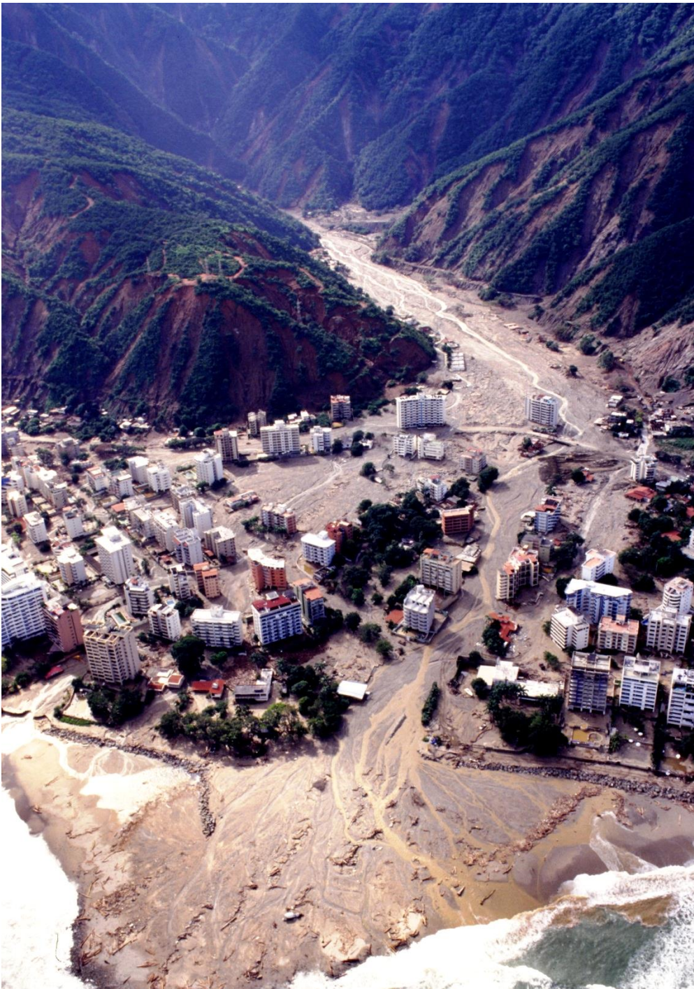
Figure 5. View to south, Vargas, Venezuela, showing numerous landslide scars on steep hillslopes and narrow river channel emanating from Sierra de Ávila mountain front onto highly developed coastal alluvial fan. Note shoreline progradation resulting from massive quantity of sediment delivered onto and across alluvial fan.