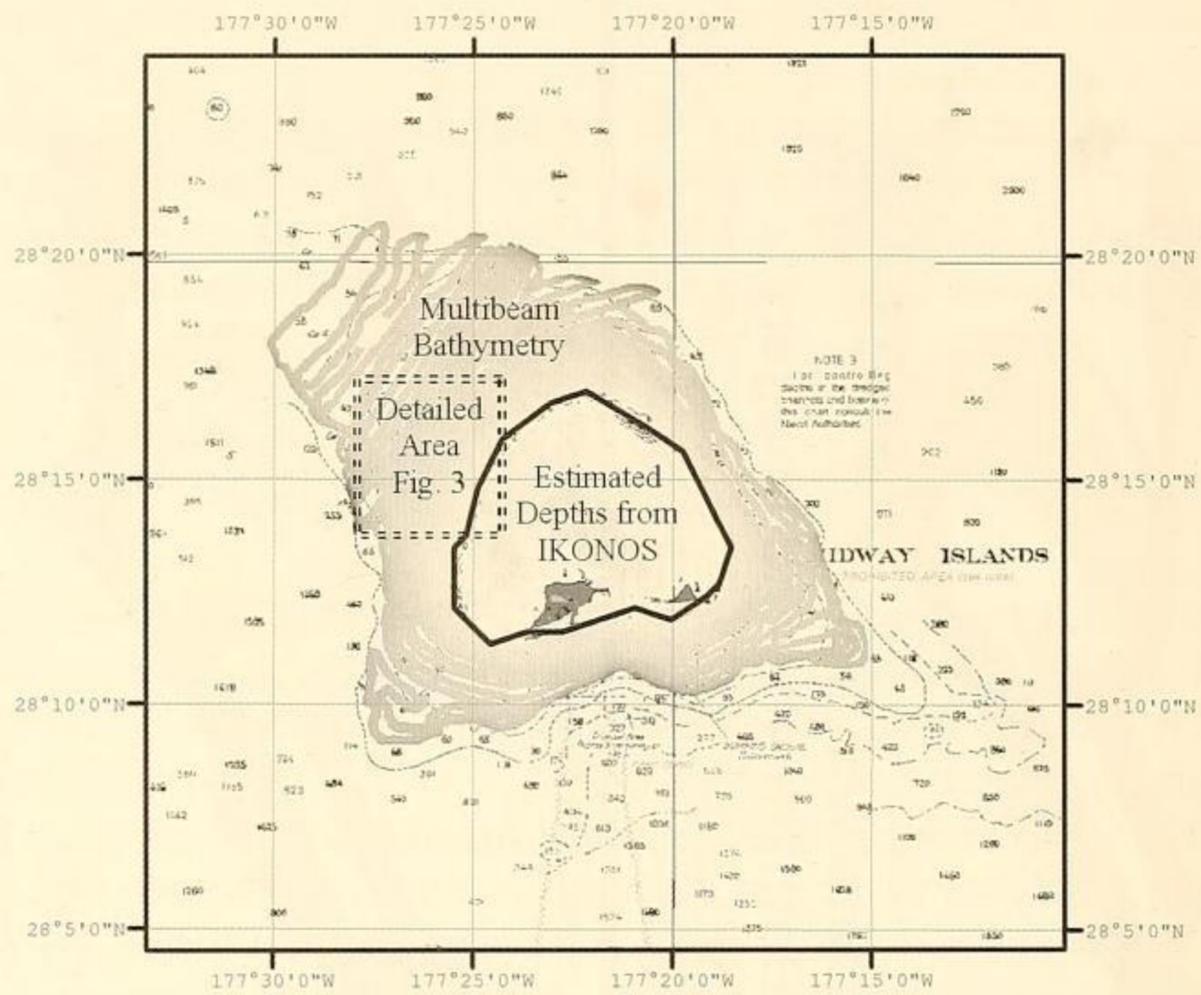
Figure 2. Hillshade of Midway multibeam and IKONOS-estimated depth data.