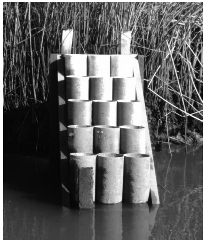
FIGURE 1 Unplanted marsh organ during low tide

As noted in previous marsh organ experiments (Kirwan & Guntenspergen, 2012; Langley et al., 2013), this experimental design