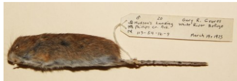
Figure 1. Southernmost specimen (UALR 236) of Reithrodontomys megalotis collected in the Mississippi Valley, obtained at Hudson Landing, Phillips County, Arkansas, on 14 March 1973.

The southernmost specimen from Arkansas was collected in Phillips County at Hudson Landing (34° 11.29' N; 91° 4.26' W) on the White River levee, about 200 m south of the pumping station on 14 March 1973 (UALR 236; ♂; collected by Gary R. Graves, catalog number 20), as compared to McDaniel et al (1978). This location lies 77 km southeast of the nearest site in Lee County. The trap was set in a Hispid Cotton Rat ( Sigmodon hispidus ) runway in a dense stand of grass and forbs at the edge of a blackberry ( Rubus sp.) thicket at the base of the levee. External measurements (total length = 113 mm; tail length = 54 mm; hind foot length = 16 mm; ear length = 9 mm) and pelage color pattern of the specimen closely resemble those of R. megalotis (Fig. 1), but the skull could not be located for confirmation in 2013.