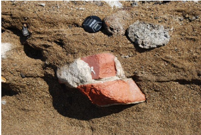
Figure 1. Bricks and concrete fragments in carbonate-cemented beach rock deposits on the Tunelboca geosite, Basque region, Spain.