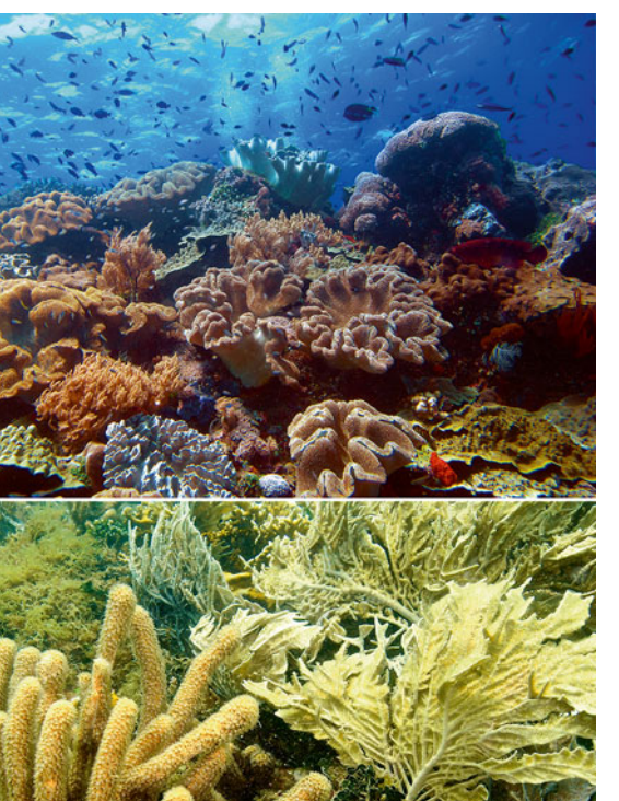
Fig. 8.2 Comparison between octocoral reef communities in the Indo-Pacific and Western Atlantic. (a) Alcyoniids from Komodo Island. (b) Gorgonids and plexaurids in a Brazilian reef (Bahia State)

In the Mediterranean (Fig. 8.1 – area 8) only 54 octocoral species have been recorded (Vafidis et al. 1994; Pastor 2006; Sartoretto 2012), although it presents an important endemism (18.5%). In the Azores (Fig. 8.1 – area 9), about 41 species have been recorded, with most of these being known to live near continental margins, near islands and seamounts (Tixier-Durivault and d'Hondt 1973; Braga-Henriques et al. 2013), its octocoral fauna, however has been little studied. Further south, according to Raddatz et al. (2011), cold-water corals occur in abundance in the archipelago of Cape Verde, but few publications include descriptions of specimens in the region. In the Canary Islands, the situation is not much different, however, at least two species were described in the 1990s (Ocaña et al. 1992; López-González et al. 1995) and one genus and species in the 2000s (Ocaña and Ofwegen 2003). The African Atlantic coast is much less studied. Lopéz-Gonzaléz et al. (2001) revealed that - at the time of their study - only 15 studies had reported on Pennatulacea for that region. These authors recorded 24 species of pennatulaceans for the African Atlantic coast, from depths ranging 0-6200 m (Fig. 8.1 - area 10).