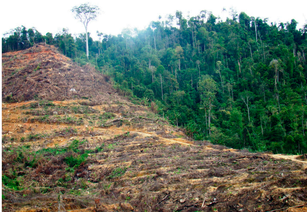
Figure 2. The forests surrounding many protected areas are being rapidly cleared or degraded. Shown is recent deforestation for oil palm plantations along the edge of Bukit Palong National Park in Peninsular Malaysia.

Many protected areas across the tropics are suffering biologically as they become increasingly isolated from surrounding forests (Figure 2) [7]. For this reason it is essential to reduce forest loss and maintain biological connectivity wherever possible in the vulnerable lands surrounding protected areas. Particularly notable are efforts by the Sabah Forestry Department and Sabah Foundation to establish forest corridors and buffer zones in the greater Danum Valley area [2]. This area is notable for containing some of the last remaining tracts of unlogged forests in all of Borneo, parts of which have never been logged. The corridors are linking together several protected areas in eastern Sabah while attempting to provide linkages between surviving lowland and upland forests. Because they harbor considerable biodiversity [10–12], selectively logged forests can provide effective buffer zones and connecting elements for such forest-conservation networks.