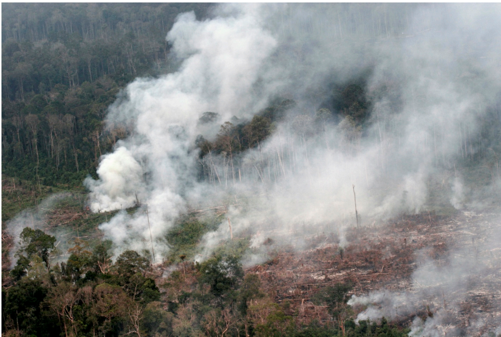
Figure 3. A destructive forest fire near Riau in central Sumatra, Indonesia.

A key priority is to consider both natural climatic variability and the prospects of future climatic change in conservation planning [26]. Current climate models suggest that El Niño droughts will increase in intensity in the western Pacific region [27], which includes Borneo. Such droughts, in concert with logging, forest fragmentation, and fire-based swidden farming, can lead to intense forest fires (Figure 3) that have severe impacts both on forests and on agricultural lands and human livelihoods [28]. Special measures, such as effectively enforced government bans on burning, may become essential during future droughts.