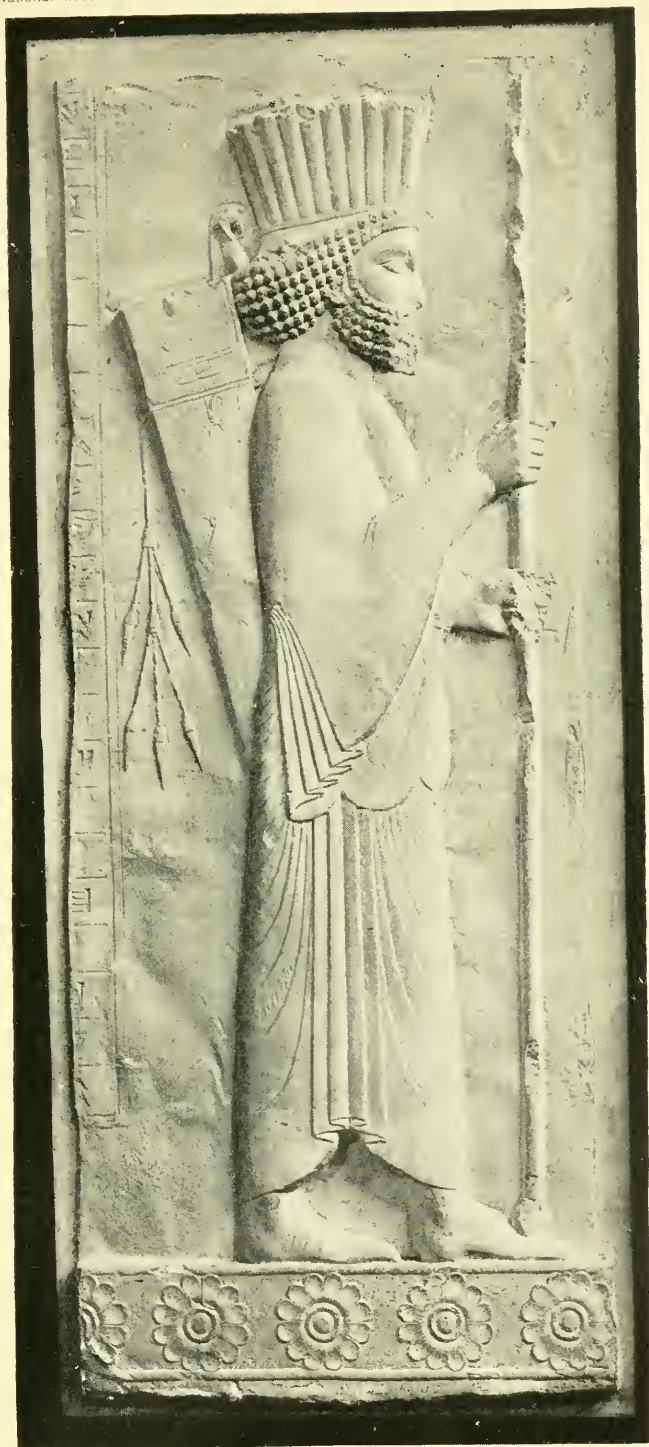
BAS-RELIEF FROM PERSEPOLIS.