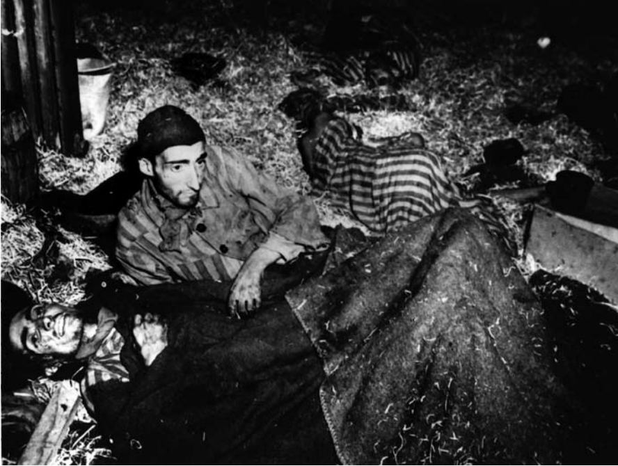
Two survivors in the Nordhausen-Boelcke Kaserne camp at the time of liberation by the U.S. Army in April 1945. The horrors of Nordhausen and the nearby underground V-weapons plant were briefly infamous in the Western press.

deliberate policy of silence by the ex-Peenemünders and the U.S. government. The former clearly had strong motivations of self-interest, and the latter wished to protect the program of importing engineers, scientists, and technicians from Nazi Germany that became best known as Project Paperclip. 2