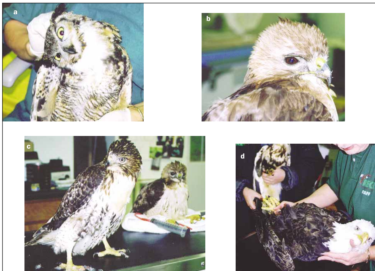
Figure 1. Symptoms of West Nile virus may include (a) head tilt (great horned owl), (b) vision problems (red-tailed hawk), and (c, d) lethargic and catatonic states (red-tailed hawk and bald eagle).

green urates (indicating liver necrosis), central blindness, unawareness of surroundings, clumsiness and weakness in the legs, and more severe tremors and seizures just before death (figure 1; Patrick T. Redig, College of Veterinary Medicine, University of Minnesota, personal communication, 2004).