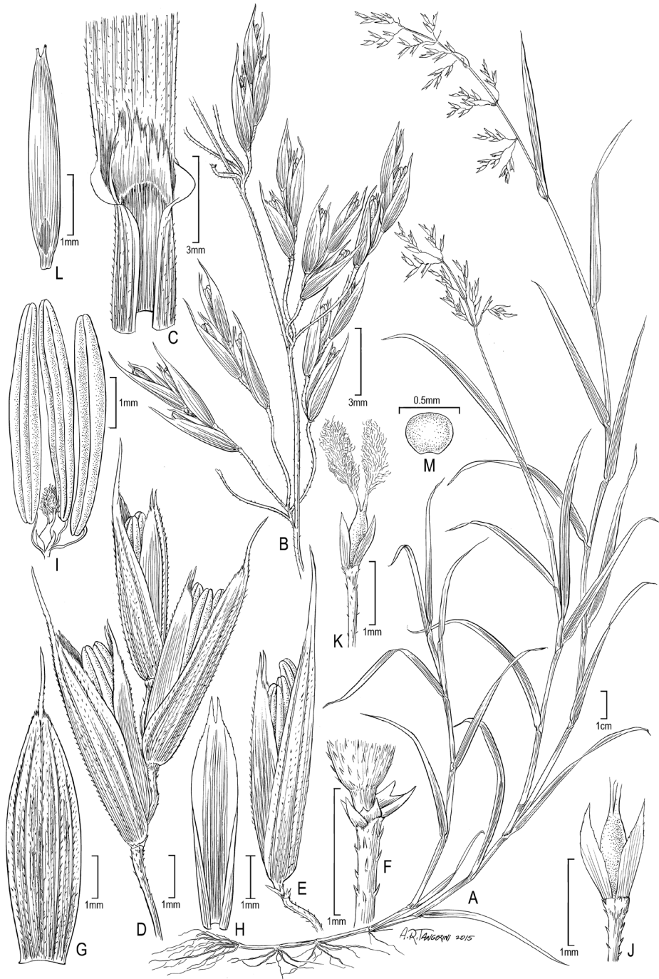
Figure 1. Poa hitchcockiana : A Habit B Panicle C Sheath, ligule, and blade D Spikelet E Lower floret with glumes at base F Glumes at base of lower floret G Lemma H Palea, ventral view I Stamens with ovary J Lodicules at base of ovary K Pistil, lodicules at base L Caryopsis M cross section of caryopsis. A–D, J–K (Peterson 16571 & Refulio Rodriguez) E, F, L, M (Apollinaire 717 & Arthur, US-913275).