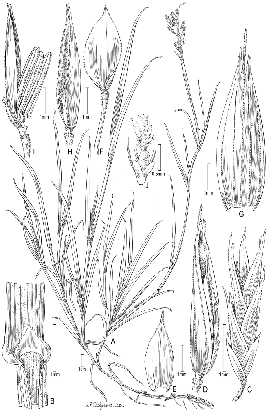
Figure 3. Poa reclinata : A Habit B Sheath, ligule, and blade C Spikelet D Lower floret E Upper glumes F Lower glume G Lemma H Palea and rachilla, lateral view I Stamens with palea J Lodicules and with pistil. (Cuatrecasas 9970 & Garcua Barriga, US-1798714).