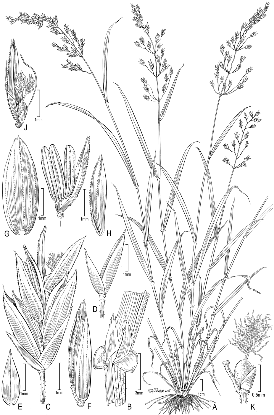
Figure 5. Poa auriculata : A Habit B Sheath, auricles, ligule, and blade C Spikelet D Glumes E Lower glume F Floret G Lemma H Palea, lateral view I Stamens with palea J Pistil enclosed in palea K Lodicules, pistil, and rachilla. (Wurdack 1145, US-2382274)