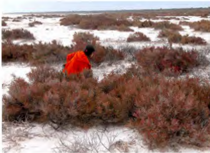
FIGURE 2. Margin of the Salinas Grandes, Córdoba Province, Argentina, at Km 895.5, National Highway 60 in October, 2003.