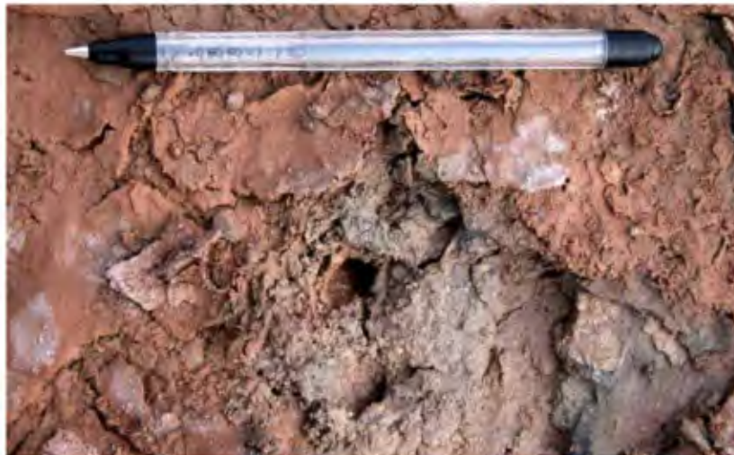
FIGURE 10. Cicindis adult burrow after removing a tiled-soil polygon.