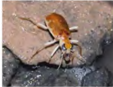
FIGURE 1. Adult Cicindis horni Bruch feeding on fairy shrimp.