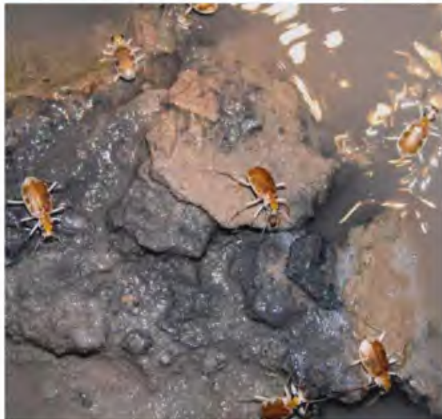
FIGURE 12. Adult Cicindis horni Bruch swarming, one individual swimming, two perching, two eating fairy shrimp, another standing.