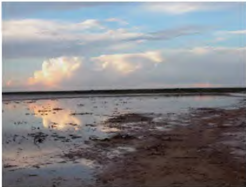
FIGURE 3. Vernal pool at margin of Salinas Grandes, Córdoba Province, Argentina at Km 895.5, National Highway 60 after the first of seasonal rains in January, 2004.