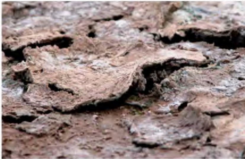
FIGURE 9. Tiled-soil polygon typical of some stretches of the shoreline surrounding Salinas Grandes.

pool surface of the total available of 15,000 square meters. Given the total size of the vernal pool, there were likely thousands of active individuals. At about this time, they also began flying to the UV light set up about 20 meters from the water's edge. The seven individuals we found at UV light were either on the sheet moving slowly or running erratically on the ground in front of the sheet. These beetles are slow fliers, although their take off from the water surface is rapid. We observed two types of flight patterns (see crepuscular activity above for one of these). When it was dark, after 2115 hrs, activity of the adults was mostly swimming, although many beetles that we tried to capture rose and flew well away above the water surface on which our net swept.