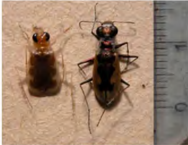
FIGURE 11. Adult Cicindis horni Bruch and Cicindela hirsutifrons Sumlin.