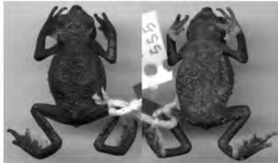
FIGURE 3. Dorsal and ventral view of an adult male of Chaunus tacana sp. nov. from Serranía Eslabón, Madidi National Park, Bolivia (MNK-A 7187).