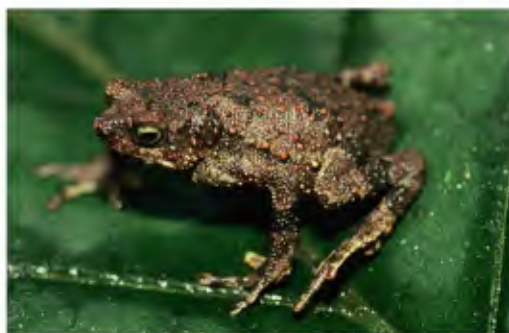
FIGURE 1. Adult female holotype of Chaunus tacana sp. nov. from Serranía Eslabón, Madidi National Park, Bolivia (MNK-A 7188)

form of the stripes. Some individuals have more red warts. SVL of two juveniles: 25.3 (MNCN 42072, female) and 21.8 (NKA-A7194, unsexed). NKA-A 7187 lack dorsal pattern and is darker than any other specimen in alcohol (Fig. 3).