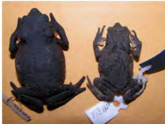
FIGURE 4. Dorsal view of an adult female of Chaunus sp. (left) from Department Cusco, Peru and the holotype (adult female) of Chaunus tacana sp. nov. (MNK-A 7188).