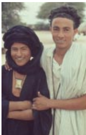
Tuareg men at encampment outside of Timbouctou, Mali.

Mali is culturally diverse with about fourteen ethnic groups living in the country, each with its own cultural traditions. The Moors (Maures) and the Tuareg, who are nomadic, live in the desert zone in the north. In this same region there are also settled communities of Sonrai, Fulani (Peul), and Boso (Bozo) living along the northern stretches of the Niger River. In the south central part of the country, the land is more arable, and there are numerous ethnic groups including the Bambara (Bamanan), Somono, Malinke, Soninke, Bwa, Senufo, Minianka, Khassonke and Dogon, among others.