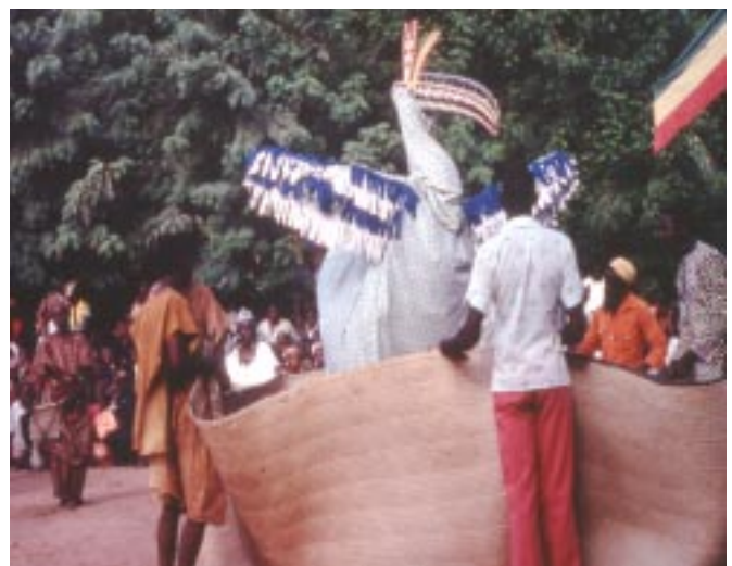
"Malikono," a puppet character that celebrates Malian independence from the French. © M. J. Arnoldi., 1980.

Because there is a common origin for the theater, there are many surface similarities to the performances of the different ethnic groups. However each group distinguishes its theater from the others by a distinctive set of drums and drum rhythms as well as different songs and song styles. The farmers and fishermen also claim ownership over different species of wild animals. Farmers perform the important land animals such as elephants, lions, and bush buffalos, while the fishermen perform the great river beasts, the manatee, the crocodile and the hippo. One important difference between fishermen and farmers is the fishermen's tradition