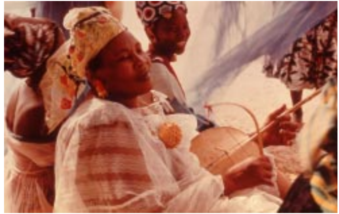
Bowed guitar (tebardent) player accompanying dance in Timboubctou, Mali..

In the last several decades, growing numbers of Malian students (over 500 in the past decade) have come to study in universities throughout the United States, and Americans have gone to study in Mali. These groups have maintained close links to people and institutions in both countries after returning home. Malians have also immigrated to the United States, establishing their families in cities throughout the country and continuing the long tradition of contributing to the cultural and economic vitality of the United States. Like Malians everywhere, Malian-Americans retain the memory of Malian history, and they preserve vital links to families and communities in Mali. They send money home, and they receive visitors from Mali. They celebrate weddings and births, and they mourn the passing of relatives and friends here and in Mali. In this way, new and dynamic connections between Mali and the United States continue to grow.