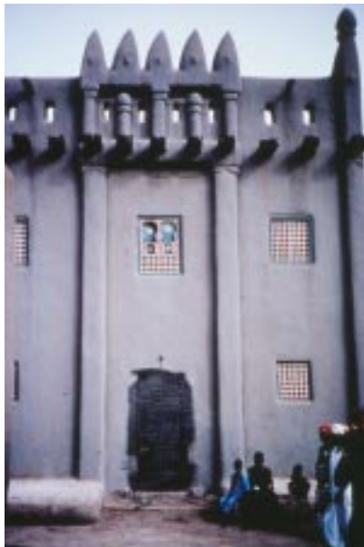
Private house in Djenne, Mali. © M. J. Arnoldi, 1997.

houses are square structures made with a series of stone or wooden pillars covered by a several-meter-high roof made of wooden tree trunks and layers of millet stalks. This distinctive and imposing structure serves as a meeting place in Dogon villages, playing an important role in the political and social life of these communities.