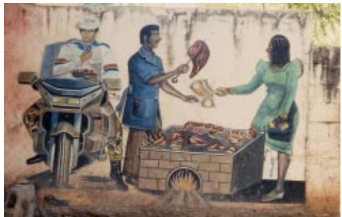
City life, Bamako Wall painting.

Today, more and more American school children are learning about Malian culture and Mali's important place in world history. As Malian music grows in popularity worldwide, it is being played on American airwaves, and more and more concert tours are coming to the United States. The internet connects Malians and Americans to one another in new and productive ways, and increasing numbers of Americans are traveling to Mali to learn about Malian history and culture first hand. Mali welcomes all of these new global educational, cultural, and economic exchanges, with the same enthusiasm she has supported such international exchanges for 1500 years or more.