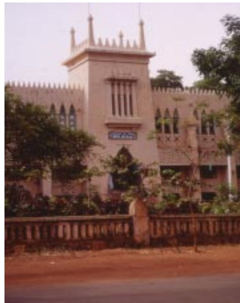
City Hall of Segou, formerly a French colonial administration building.

Not surprisingly, each ethnic group has contributed in distinctive ways to the musical heritage of the