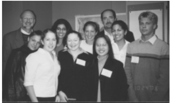
Students and their Teachers from Washington-Lee High School in Virginia.

The day consisted of the initial panel of scholars and a journalist, with Q & A; two break-out sessions (the first included sandwiches); and a final keynote speaker who was a second journalist. For each break-out session, students and teachers were individually assigned by the organizers to one of five groups, headed by one of