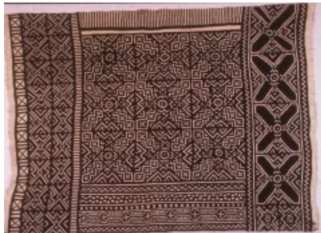
Woman's wrapper, Bogolan fini (mud-dyed cloth). Made by Nakunte Diarra. © Department of Anthropology, NMNH, SI, 1994.

Project 2: Create a play about a "day in the life" of an ancient or modern Malian. Have students incorporate as many ways as possible to illustrate daily life, including transportation, clothing, food, school, trade, climate, etc.