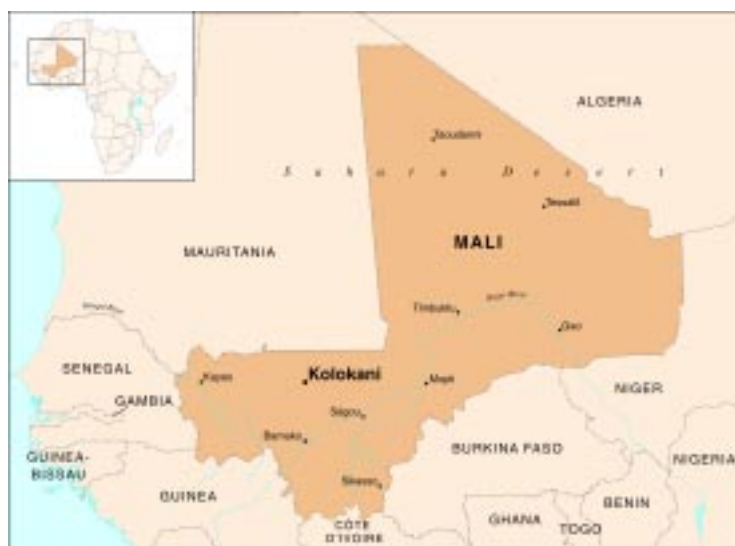
Map of Mali

When he [the king of Ghana] gives audience to his people...he sits in a pavilion...and on his right hand are the sons of the princes of his empire, splendidly clad and with gold plaited into their hair....The gate of the chamber is guarded by dogs of an excellent breed: ...they wear collars of gold and silver, ornamented with the same metals. The beginning of a royal audience is announced by the beating of a kind of drum which they call deba , made of a long