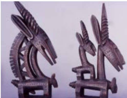
Bamana Ciwara. Wooden antelope headdresses, carved by the Bamana blacksmith, Siriman Fane. Department of Anthropology, NMNH, SI.

Malian crafts are one of the most dynamic sectors of the current Malian economy, evidenced in the extraordinary diversity of textiles, wood sculptures, leather goods, and works in silver and gold. Exceptionally fine wood sculptures from among the Bamana, Dogon and Senufo groups are among the art masterpieces exhibited in museums worldwide. Certain of these sculptures, like the Bamana Ciwara headdress used in agricultural festivals, and a variety of Dogon wooden masks used in funeral rites, have taken on new meanings today as they have been embraced as national rather than ethnic symbols.