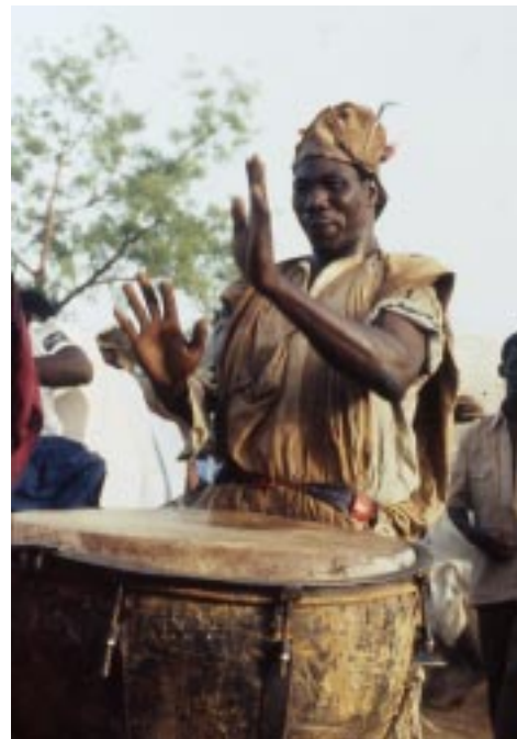
Bamana Drummer.

Project 2: Ask students to think about and discuss whom they would choose as their heroes, whether historic figures or people they know, and why. How is each student "heroic" through a deed or accomplishment?