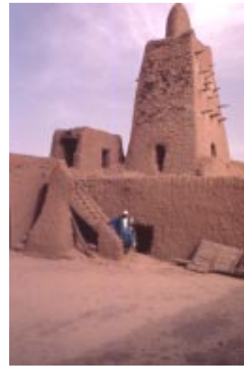
Djinguereber mosque, Timbuktu, Mali..

The adoption of Islam in the ancient empires also forged important links eastward to Egypt and beyond. In the 14th century the Malian emperor, Mansa Musa, made the Hadjj, the holy pilgrimage to Mecca—required of every Muslim during his or her lifetime if possible—taking with him a large entourage and scores of camels laden with gold. His arrival in Cairo and later Mecca was recorded in chronicles of the day and caused quite a stir as the quantity of gold he brought with him caused the collapse of the Cairo gold market. Muslim scholars and architects accompanied Mansa Musa on his return to Mali, and they took up residence in Timbuktu and other cities. Later at the end of the fifteenth century, the celebrated Songhai emperor, Askia Mohammed, also made a pilgrimage to Mecca, and his journey and the resulting exchanges were also recorded in various chronicles. In one important chronicle the Tariq el Fettach, Timbuktu was described as a city without equal in Black Africa and a city that was especially known for the courtesy and assistance given to students and men