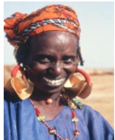
Bozo woman with gold jewelry near Mopti, Mali. © Eliot Elisonfon, 1970. Image no. 2584 NMAfA, S.I.

The communities can be divided into three main groups based on their primary occupations of herding, fishing, or farming. Moors, Tuaregs and Fulani are nomadic herders of camels, cattle, sheep and goats. Boso and Somono are fishermen who ply the waters of the Niger and Senegal rivers and their tributaries. The remaining groups are primarily sedentary farmers, who cultivate grains such as millet, corn, and rice, and grow other crops for export such as cotton and peanuts. Although Soninke are farmers, many families have also been skilled merchants throughout the centuries and played a central role in the ancient empires and the trans-Saharan trade.