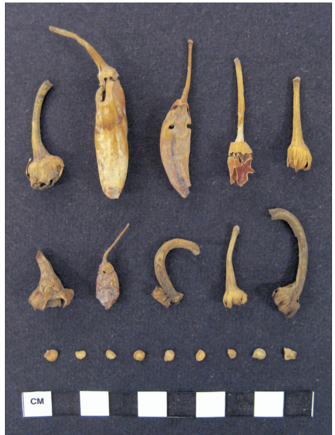
Fig. 2. Desiccated specimens of chili peppers from Guilá Naquitz and Silvia's Cave. (Top) Left to right: Cultivar 1 from square C8 at Guilá Naquitz; cultivar 2 from square F1 at Guilá Naquitz; cultivar 3 from square C12 at Guilá Naquitz; cultivar 4 from square D12 at Guilá Naquitz; and cultivar 5 from square G4 at Guilá Naquitz. (Middle) Left to right: Cultivar 6 from square F1 at Guilá Naquitz; cultivar 7 from square F1 at Guilá Naquitz; cultivar 8 from feature 1 at Silvia's Cave; cultivar 9 from feature 1 at Silvia's Cave; and cultivar 10 from square 2 at Silvia's Cave. (Bottom) Seeds from square C8 at Guilá Naquitz.

Pepper cultivars from Silvia's Cave have been numbered C8–C10 and are all single specimens. Cultivar 8 is characterized