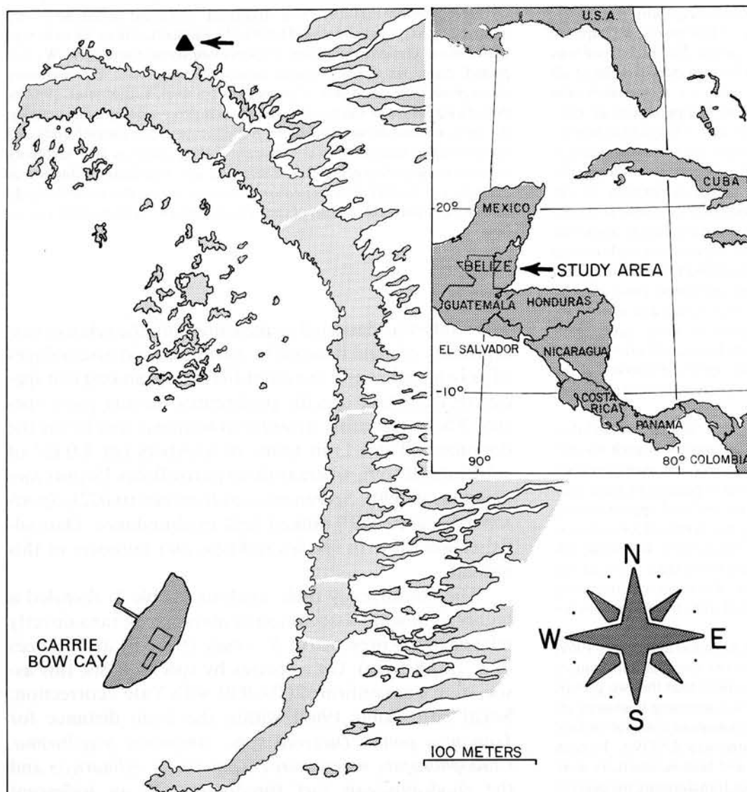
Fig. 1. Location of the study area (dark triangle) on the Belize barrier fore-reef

Styopodium zonale apparently is not an important food source of either fishes or urchins (Gerwick 1981), although Diadema antillarum will consume it at low levels (Littler et al. 1983 b). L. Coen (personal communication) indicates that S. zonale is the least preferred alga by herbivorous crabs among the numerous macrophyte species he has tested at Carrie Bow Cay.