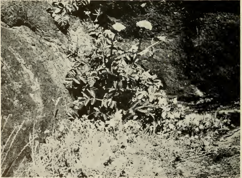
Fig. 1, upper: Angelica hendersonii growing along the rocks of the Oregon coast at Finistere Lodges, Depoe Bay. On the ground above Conioselinum chinense and Heraclium lanatum are abundant. Fig. 2, lower: Angelica hendersonii in the same locality as above.