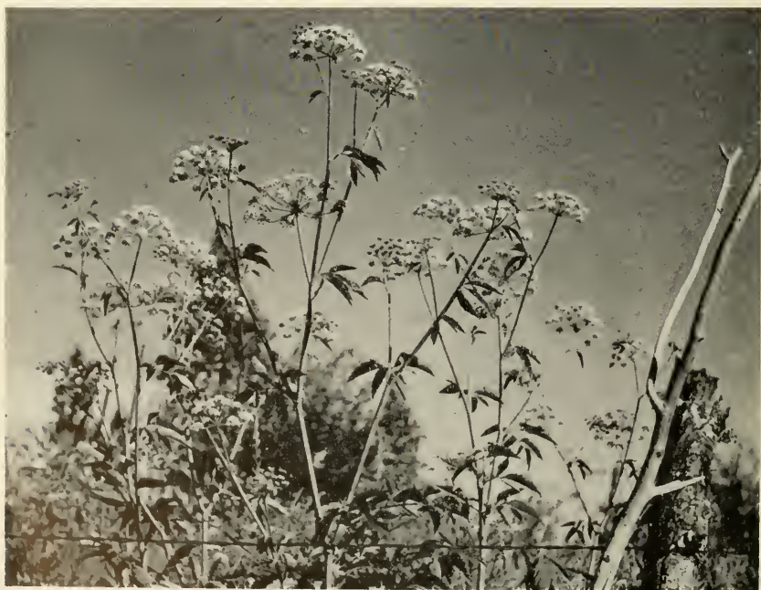
Fig. 1, upper: Cicuta occidentalis growing in association with tule, grasses, and Typha at Rock Creek, Oreg., at the junction with State Highway 82. Fig. 2, lower: Cicuta occidentalis , uninfested, at Carlton, Wash.