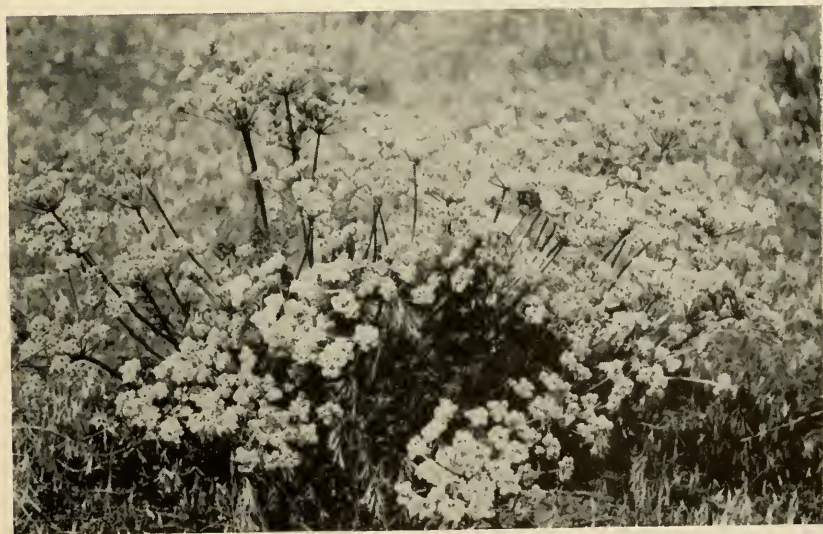
Fig. 1, upper: Pteryxia terebinthina foeniculacea growing in association with grasses, Artemisia , and Chrysothamnus 8 miles west of Moses Lake, Wash. Fig. 2, lower: Pteryxia terebinthina foeniculacea , same locality.