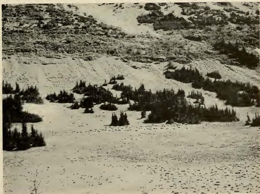
Fig. 1, upper: Slate Peak, Whatcom County, Wash. Four species of Lomatium are found on the slopes shown in the center of the photograph. These are L. ambiguum , L. brandegei , L. dissectum , and L. geyeri . Fig. 2, lower: The same locality as above but farther east. On the steep shale slopes in the upper part of the illustration the same four species of Lomatium listed above are found.