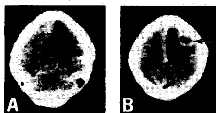
Fig 1—Horizontal CCT scan of an adult proboscis monkey with left hemiparesis caused by an abscess in the right frontal lobe. An area of decreased density, representing edema (arrow), is in the right frontal region, producing a right-to-left shift of cerebral tissue (A). Following injection of contrast material, a ring of enhancement defines the necrotic core (arrow) of the abscess (B). These are typical findings in cases of encapsulated brain abscess.

From the Department of Animal Health, National Zoological Park, Smithsonian Institution, Washington, DC 20008 (Janssen, Bush); Children's Hospital, National Medical Center, Washington, DC 20010 (Hammock); and the Department of Radiology, George Washington University Medical Center, Washington, DC 20037 (Davis).