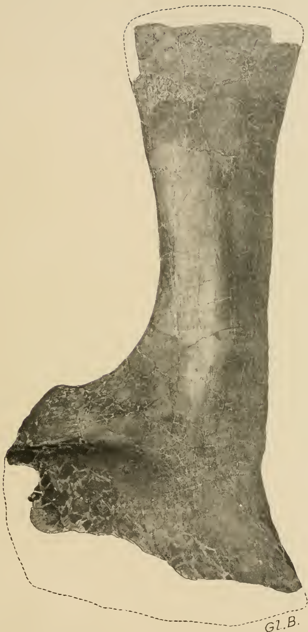
LEFT SCAPULA OF ALAMOSAURUS SANJUANENSIS