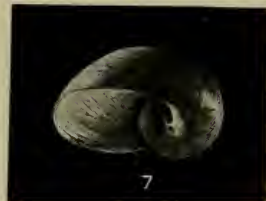
CENTRAL MEXICAN LAND SHELLS