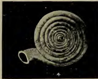
CENTRAL MEXICAN LAND SHELLS