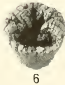
A NEW DEVONIAN CRINOID FROM WESTERN MARYLAND (See opposite page for explanation.)