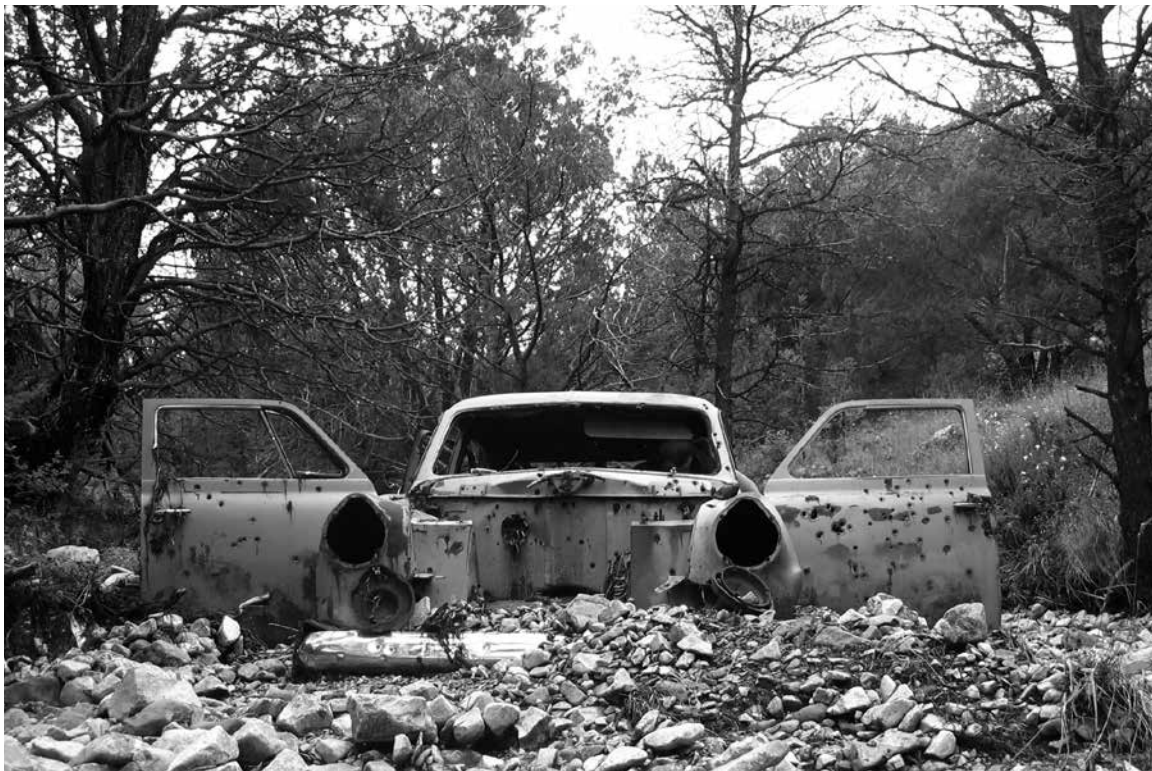
Anthropogenic “clast” in stream sediment in Sawmill Canyon east of Mayhill.