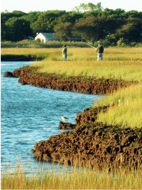
PLATE 1. Two recreational anglers fishing from the bank of a marsh that is unvegetated and crumbling at their feet into the creek. A trophic cascade links this fishing activity with the collapse of salt marsh vegetation because the removal of predatory fish and crabs by anglers allows the population of herbivorous Sesarma crabs to proliferate, and those crabs in turn clear-cut the marsh vegetation.

Our results establish a large-scale association between recreational overfishing and salt-marsh die-off and provide the first evidence connecting the local depletion of top predators with salt-marsh die-off. This suggests that overfishing may be a common mechanism underlying trophic-level dysfunction (Steneck et al. 2004), where predator populations are below the functional threshold where they can control herbivores, driving the epidemic of salt-marsh die-off throughout the western Atlantic. More generally, our study is among the first to provide evidence that localized predator depletion can generate shifts in marine community structure and dynamics (Eriksson et al. 2009), and it supports an emerging perspective that predator depletion can lead to rapid collapse of coastal ecosystems and the services they provide (Worm et al. 2006). Our experimental results compliment other studies examining the impacts of predator depletion on coastal marine ecosystems as inferred from either historical trends (Estes et al. 1998, Jackson et al. 2001, Frank et al. 2005, Lotze et al. 2006, Daskalov et al. 2007, Myers et al. 2007) or the implementation of no-take areas where changes in intermediate- and basal-trophic levels are attributed to