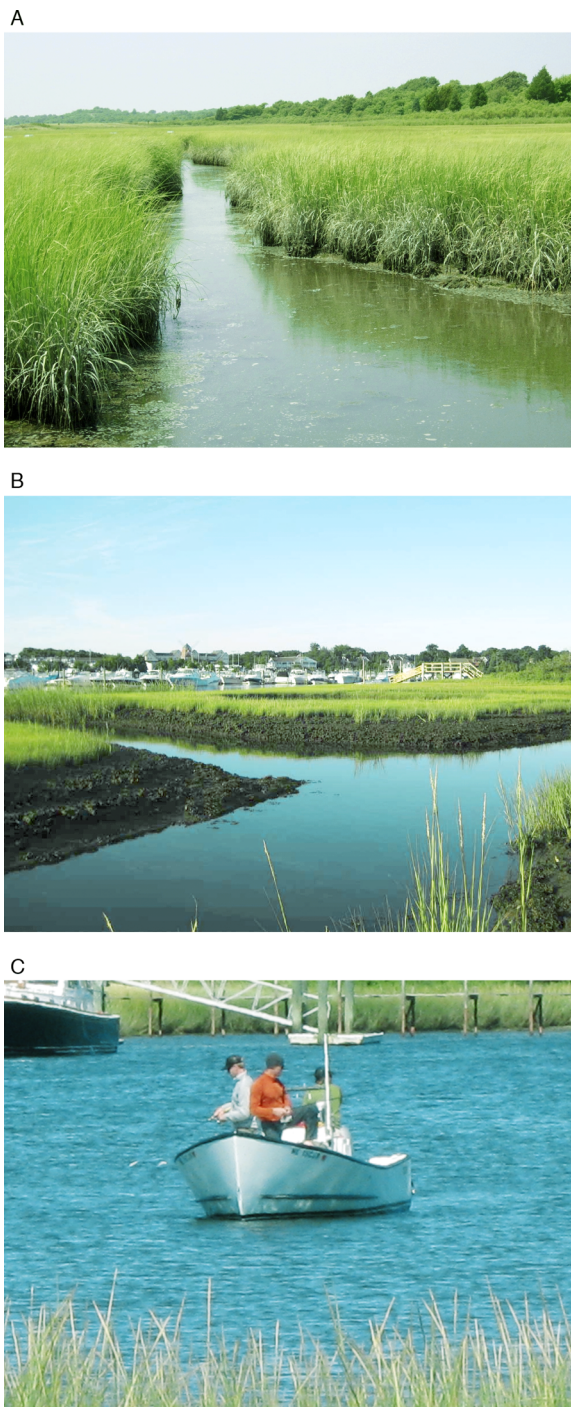
FIG. 1. Representative photos of (A) vegetated and (B) die-off salt marshes, and (C) recreational fishing at a study site in Cape Cod, Massachusetts, USA. At vegetated marshes without localized fishing pressure, cordgrass, Spartina alterniflora , extends to the water's edge at low tide. At marshes with recreational fishing activity, Sesarma crabs have consumed vegetation in the low intertidal, leaving expansive die-offs along the marsh margin.