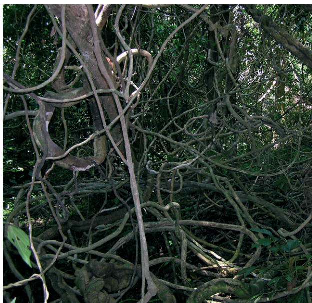
Figure 1 Liana tangle in the forest understory on Barro Colorado Island, Panama. Liana tangles are created by treefalls, when the lianas are dragged into the treefall gap, but stay alive and eventually climb back to the forest canopy, leaving the legacy of twisted and winding stems in the forest understory. Liana tangles such as this can persist in the forest for decades (Schnitzer et al. 2000).

Not all studies, however, have unequivocally supported the increasing liana hypothesis. Caballé & Martin (2001) reported that over a 13-year period (1979–1992) in a Gabonese tropical forest, the density of lianas and trees ( \geq 5 cm d.b.h.) decreased 20 and 5%, respectively, whereas liana basal area remained the same while tree basal area increased slightly. In the Democratic Republic of Congo, Ewango (2010) found that the density of a single, highly dominant liana species in two 10-ha plots decreased 97% over a 13-year period (from 1994 to 2007), resulting in an overall decrease in liana abundance from 750 to 499 per ha (for individuals \geq 2 cm d.b.h.). When excluding this one species, however, liana density remained unchanged over the 13-year