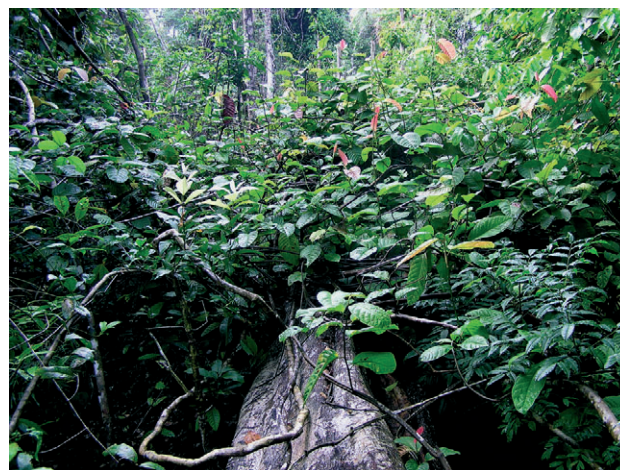
Figure 3 Lianas covering a recent fallen tree on Barro Colorado Island, Panama. Nearly all of the leaves in the foreground belong to the liana Coccoloba parimensis (Polygonaceae), one of the most common liana species on Barro Colorado Island and one with a high propensity for vegetative reproduction (S. Schnitzer, unpublished data).

There is now overwhelming evidence that liana abundance, biomass and diversity increases with disturbance, tree mortality and forest turnover (e.g. Putz 1984, DeWalt et al. 2000, Schnitzer et al. 2000, 2004, 2008b; Schnitzer & Carson 2001, 2010). Lianas capitalize on disturbed areas because they first recruit into them with large numbers and then grow rapidly in the high-resource environment. Lianas may be particularly abundant and diverse in such disturbed areas as treefall gaps because they can colonize gaps by seed, advance regeneration, lateral growth from the intact understory along the forest floor (e.g. Peñalosa 1984; Schnitzer et al. 2000), and long-distance clonal recruitment (Rutishauser 2011), whereas trees typically use only the first two methods (Schnitzer et al. 2000, 2008b). Lianas commonly fall into understory following a canopy disturbance (Putz 1984; Schnitzer et al. 2000; Phillips et al. 2005; Ingwell et al. 2010), where adult stems re-root and produce new stems (Fig. 3). As many as 90% of the lianas pulled into a gap during the treefall can survive and regenerate in the gap (Putz 1984).