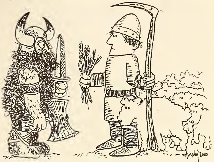
A NEW IMAGE FOR THE VIKINGS (?)

important new sites have yielded rich information about the Greenland Norse, including the "Farm Beneath the Sand" site. Here a farm that was occupied for 300 years was preserved in permafrost and yielded many spectacular artifacts including an entire door, loom, and whole animal carcasses. Studies of such sites enable scholars to ask how the Greenland colonies functioned and whether they died out as the result of a little Ice Age, overpopulation and depletion of natural resources, isolation from Europe, raids by pirates, Inuit (Eskimo) attack or territorial infringement, immigration to America, or simply gradual population loss.