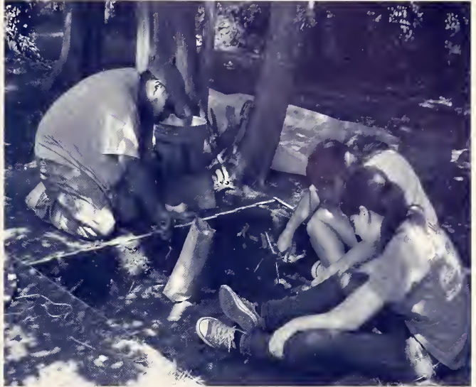
University of Maryland, College Park, students excavating a portion of the foundation walls of the open cellar on Long Green.

In the attic, next to the chimney of an overseer's house ("the Captain's House") and overlooking the Long Green, was a two-headed, carved wooden figure that was