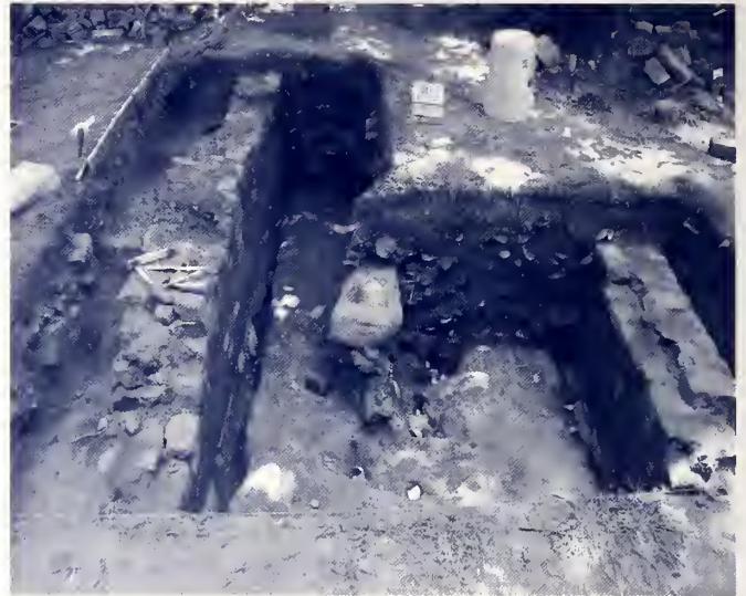
Excavation on Long Green. An open cellar, filled in the early 19th century, contained within one of the excavated buildings (the Middle Building, Locus 3).

On a rise on the Long Green, there is a 40 x 25 foot building exactly where Douglass described a blacksmith's and a cooper's shops. However, the archaeology shows a long low frail building containing no material