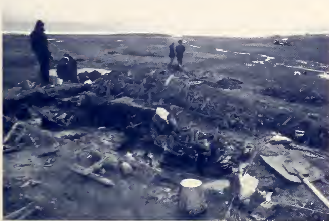
Excavations at 8,000 year old Zhokhov Island site in the Siberian Arctic.

At the end of the Pleistocene, 12,000 years ago, the northern hemisphere warmed rapidly. Ice sheets melted, vegetation zones moved north, and sea levels rose. These climate-related changes coincided with the first people arriving in America. Migrating across the land bridge between Siberia and Alaska, or—equally possible—traveling over the ice, or voyaging by boat, these early Siberians spread south along the Pacific coast or through an inland ice-free corridor in western Canada. The earliest identifiable culture in North America is called Clovis, after the archaeological site that produced the first distinctive fluted spear point that defines these people's culture. Within 1000 years Clovis people had spread throughout North and South America, creating the foundation for all later cultures of the New World, except in the Arctic.