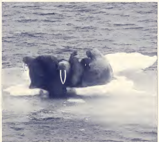
The walrus' habitat is melting under them as the Arctic ice cover shrinks.

As an archaeologist I am used to looking deeper into the past than people's memories—or even recorded history. Archaeology gives us a way to study history hun-