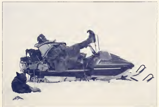
Saami (Lapp) reindeer-herder relaxes with new transport vehicle.