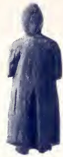
Thule (Eskimo) carving of a Norseman seen in Hudson Strait ca. A.D. 1300.

The Danish and Norwegian Vikings who began moving west across the North Atlantic about A.D. 800 were spurred by warming climate and superb ships. Within 200 years Vikings had colonized Shetland Islands, the Faeros, Iceland, and eventually Greenland, which Erik the Red settled in 985. By 1000 Leif Eriksson and other Greenland and Icelandic Norse had reached Newfoundland and the Gulf of St. Lawrence, where they established a colony in "Vinland." In the 1960s "Vinland" was discovered in northern Newfoundland at a site called L'Anse aux Meadows. Its three sod houses and shops conform to the Viking saga accounts and date exactly to A.D. 1000. But the Norse soon abandoned this site and the Vinland region probably due to Indian and Eskimo attacks and the high cost of maintaining a colony so far from Greenland and Iceland. Nevertheless a Norwegian penny dating to 1085 found in an Indian site on the Maine coast shows that Greenland or Iceland Norse continued to voyage to the American mainland, obtaining timber for building boats.