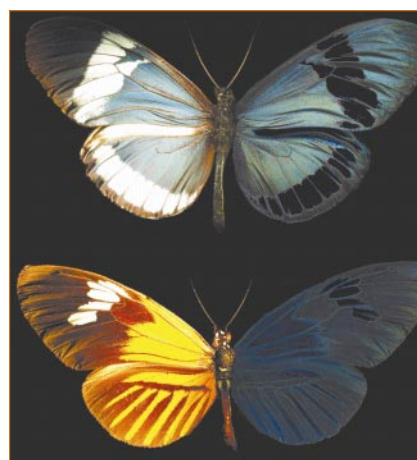
Figure 1 Polarized iridescent patterning of the butterfly Heliconius cydno (top) compared with H. melpomene malleti (bottom), whose wings do not show polarized iridescence. Photographs of left wings are unmodified; images of right wings were generated by taking two photographs through a polarizing filter that was rotated by 90° between exposures, and then producing the difference of the two images in Photoshop (Adobe). H. cydno shows a pattern of polarized and depolarized regions, whereas H. melpomene malleti shows no polarization pattern. Wing spans, 9 cm.

‡Institute of Cell, Animal and Population Biology, University of Edinburgh, Edinburgh EH9 3JT, UK