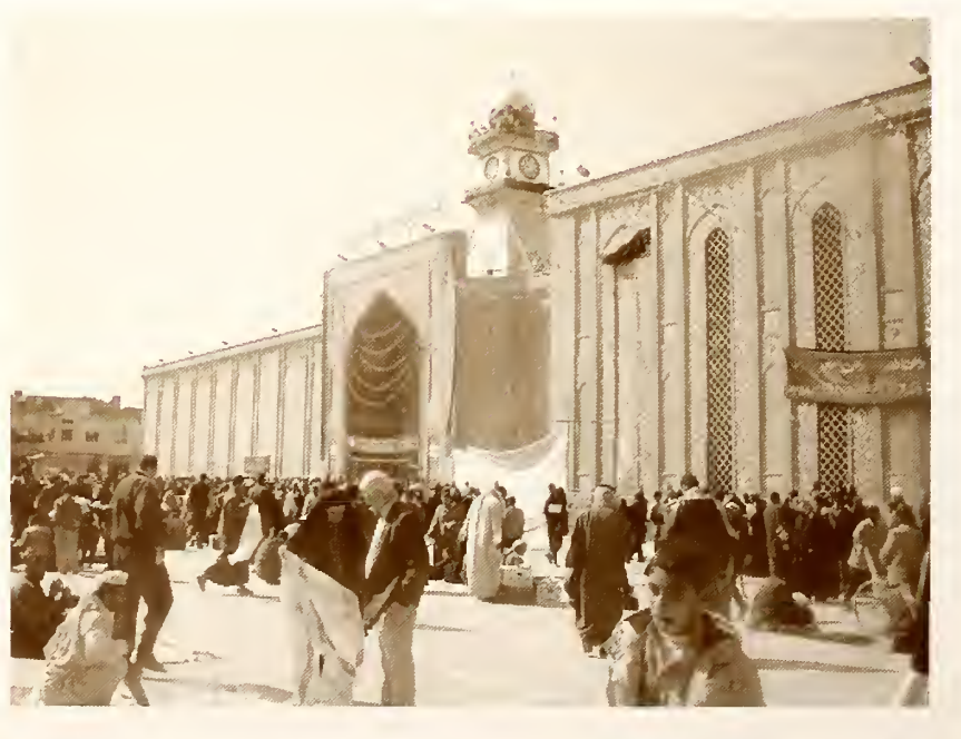
Iman Ali Shrine in Najaf.

These are Shi'a community members who worked closely with member of the Bush administration in the invasion of Iraq. (Council on Foreign Relations 2003). This group