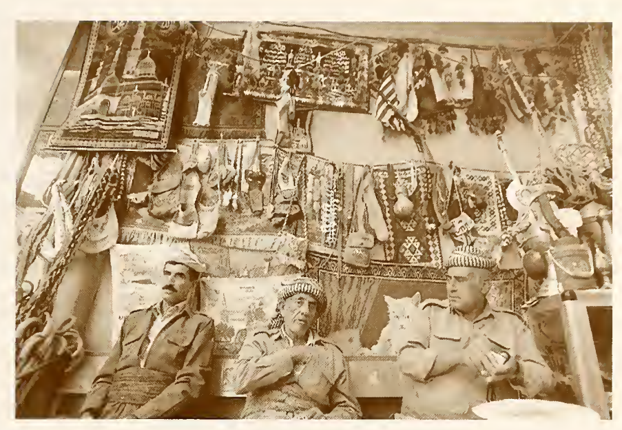
Kurdish merchants in the city of Dahuk, Iraq.

These are the Sunni Arabs who had ruled Iraq under Saddam Hussein, and who came from the town of Takrit, Saddam's birthplace, and other Western areas of the coun-