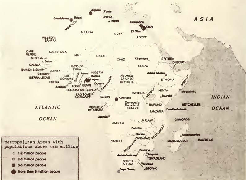
G 42011 © 100% (300mm x 229mm)

Several moments overlap between 1800 and 1900. The "Money Drives the Slave Trade" moment examines the causes and effects of the Atlantic slave trade between 1500 and the 1860s. "Trade Transforms Africa" presents the dramatic changes in trade in central Africa from the early 1800s through the early 1900s. Both these stories demonstrate Africa's connections to the rest of the world, and both show how events on the world stage shifted local economies in Africa toward exports. This tendency was intensified under colonialism, and "Colonialism Yields to Independence" shows European powers setting the rules for the scramble for Africa at the Berlin Conference (1884-1885) and Africans responding to colonialism in a variety of ways from the late 1800s through 1990. As a counterpoint to the colonialism moment, "Ethiopia Prevails over Italy" tells the inspiring story of the Ethiopian army's stunning victory over Italian invaders at Adwa in 1896. Because the last two hundred years have seen so much change in Africa, several moments on the history pathway present different aspects of this complex history.