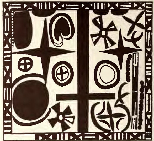
The crosses and circles in this contemporary image from the Democratic Republic of Congo evoke physical and spiritual crossroads for many kiKongo-speaking people.

Another installation tells of the horrors of being enslaved: visitors can hear the voices of people