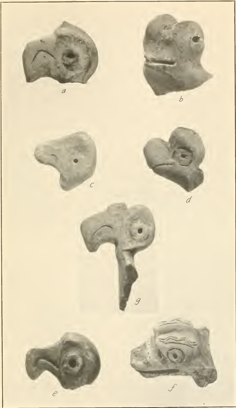
Pottery lugs from Arauquin, Venezuela. a, g, e , identifiable as vulture or hawk heads. f shows signs of white paint. These pieces are remarkable for their simplicity and strength of style.