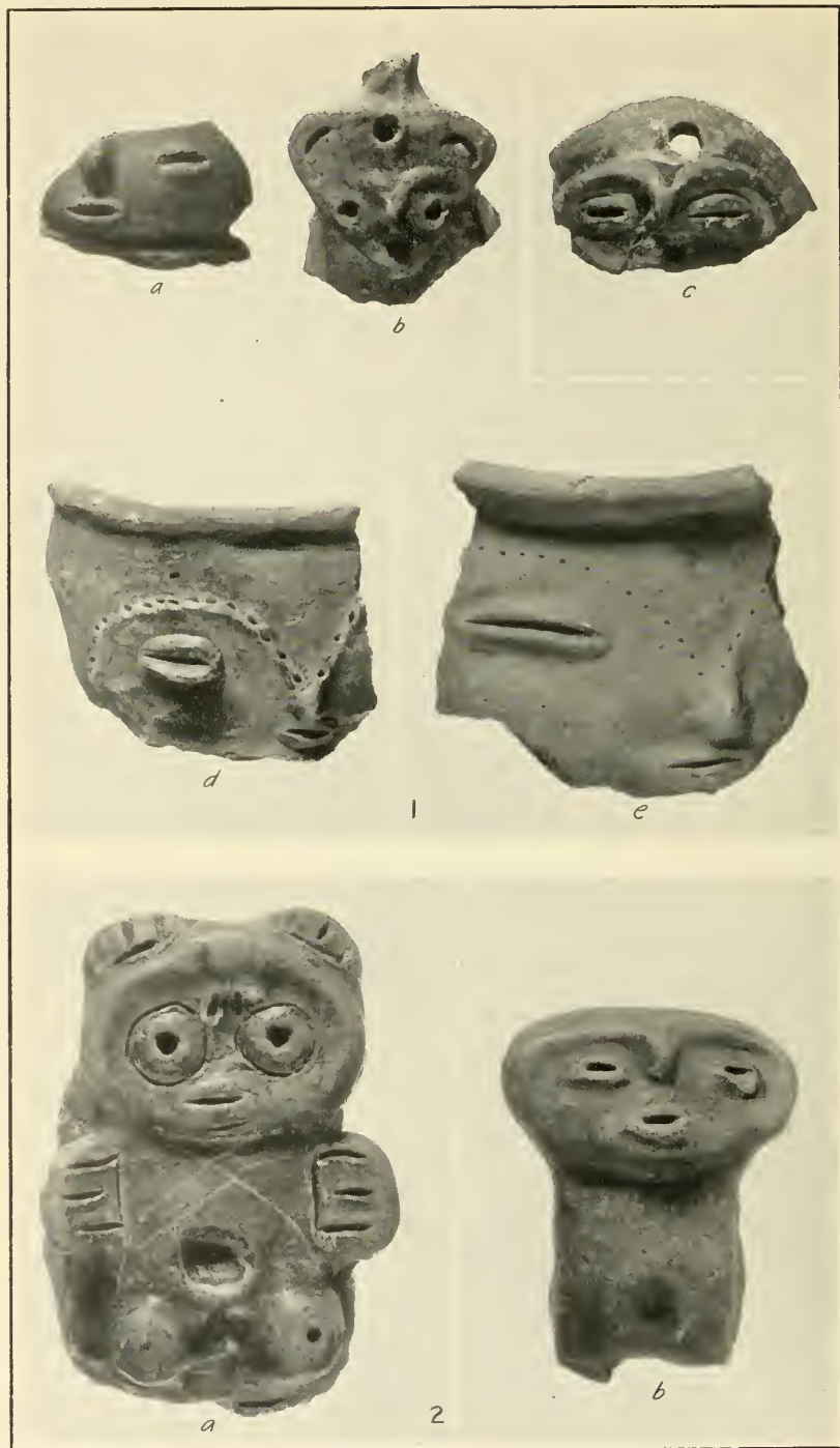
Pottery from Apure, Venezuela. 1. From Arauquin. a, c , Fragments. b , Lug. d, e , Rim fragments. 2. Figurines from Las Trincheras.