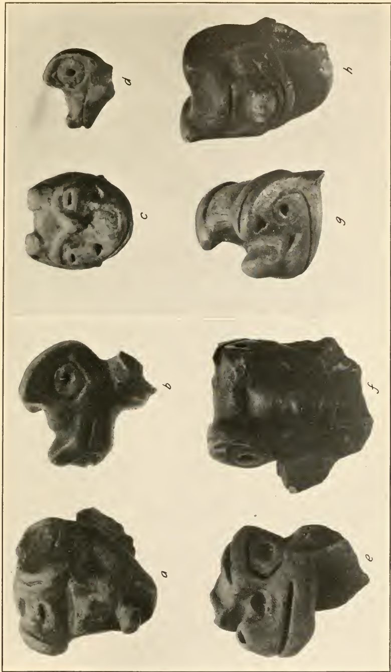
Pottery lugs from Arauquin, Apure, Venezuela. It is impossible to identify these representations of animalistic forms with any certitude.