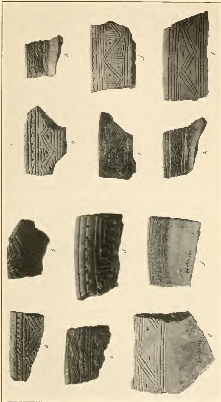
Pottery fragments from Arauquin, Apure, Venezuela. Most of the designs appearing on the pots herds are incised in rectilinear; e, however, shows curvilinear designs.