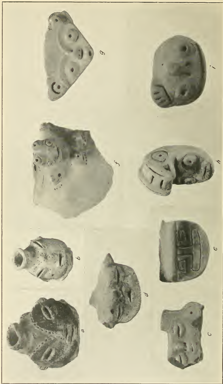
Potsherds from Arauquin, Venezuela. a, b , Upper portions of vessels. c, f , Rim fragments. d, e, g, h, i , Lugs. b and h show signs of white paint.