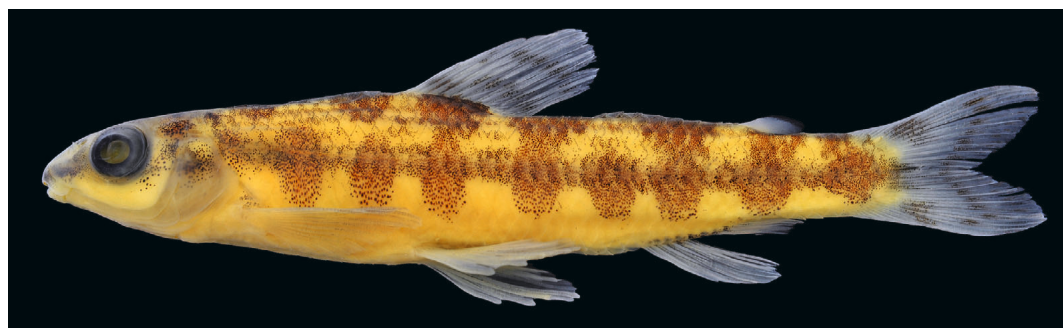
Fig. 2. Nannocharax dageti , CUMV 91303, 34.4 mm SL; Zambia: Northern Province: Samfa rapids at pontoon on Chambeshi River.

1972.8.4.18–32, 11 of 15, 21.8–39.1 mm SL (10 measured, 27.1–39.1 mm SL); Zambia; G. Bell-Cross. – CUMV 91303, 5, 30.1–34.4 mm SL, Zambia: Northern Province: Chambeshi River drainage, Samfa Rapids at pontoon on Chambeshi River; 10°51'07.5"S 31°10'02.2"E; R. Bills, Chilala & J. P. Friel, 11 Oct 2005. – MRAC P-96083.1136–96083.1139, 4, 26.8–29.9 mm SL; Zambia: Chambeshi River system, Lukupa River, approximately 28 km on road from Kasam to Luwingu; 10°10'49.9"S 30°57'45.4"E; L. de Vos, 20 Oct 1995. – MRAC P-142078–142081, 4, 35.5–44.2 mm SL; Zambia: Solwezi River, Kafue River system; 12°12'S 26°24'E; G. Bell-Cross, 8 Mar 1963. – MRAC P-144818–144821, 4, 32.2–41.9 mm SL; Democratic Republic of the Congo: Katanga: Kimilolo River, environs of Lubumbashi (formerly Élisabethville); M. Lips, Sep 1962. – MRAC P-144872–144873, 2, 26.6–27.9 mm SL; Democratic Republic of the Congo: Katanga: environs of Lubumbashi (formerly Élisabethville); M. Lips, 1963. – ZSM 41949, 3, 26.0–29.2 mm SL; Democratic Republic of Congo: Lualaba Province: Kasai River below and above Saipako Falls, 975 m asl, approximately 15 km by air NNW of Dilolo at