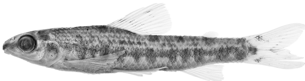
Fig. 1. Nannocharax dageti , MRAC P-88846, holotype, 34.8 mm SL; Democratic Republic of the Congo: Kando.