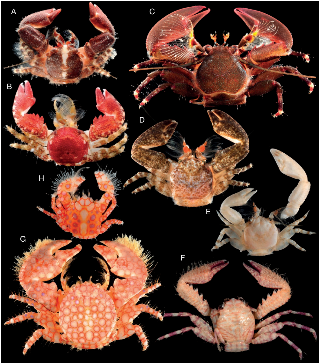
FIG. 4. — A , Petrolisthes hispaniolensis Werding & Miller, 2005, 1 ♂ 3.3 × 3.2 mm, MNHN-IU-2013-7156, st. GM22; B , Petrolisthes jugosus Streets, 1872, 1 ♀ 3.8 × 4.1 mm, MNHN-IU-2013-5292, st. GM07; C , Petrolisthes politus Gray, 1831, 1 ♀ ov. 6.0 × 6.3 mm, MNHN-IU-2013-5076, st. GM07; D , E , Petrolisthes quadratus Benedict, 1901; D , 1 ♀ 4.0 × 4.1 mm, MNHN-IU-2013-5298, st. GM10; E , 1 ♂ 3.5 × 3.5 mm, MNHN-IU-2013-6886 (right cheliped is detached), st. GM10; F , Petrolisthes rosariensis Werding, 1978, 1 ♀ 3.3 × 3.0 mm, MNHN-IU-2013-5427, st. GD20 (preserved specimen); G , Porcellana sayana (Leach, 1820), 1 ♂ 9.9 × 9.1 mm, MNHN-IU-2013-4985, st. GR31; H , Porcellana sigsbeiana A. Milne-Edwards, 1880, 1 ♂ 3.1 × 2.6 mm, MNHN-IU-2013-5218, st. GB17. Magnification is about × 3 for C, G, and × 5 for the others species.