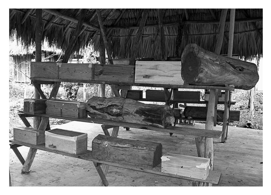
Fig. 1. Meliponary of the authors in the Zona Maya, at ECOSUR, in Chetumal, Mexico.

Francisco Javier Clavijero (1824) reported that Mexican meliponicultors owned up to 500 colonies, similar to even older reports among civilizations in South America (Roubik, 2000). Honey was the sweetener used before sugar cane Saccharum officinarum (Poaceae) was known in the American tropics, and there were no Old World honey bees, genus Apis , thus honey came from native stingless bees, bumble bees and some wasps (Roubik, 1989, 2000). Honey also was used to pay tributes, perform various rituals, and in exchange for goods (Gonzalez-Acereto et al. , 2011; Ayala et al. , 2013). Today, in the Zona Maya region discussed here, it is extremely difficult to find a stingless bee-keeper—'meliponicultor'—with even 50 colonies. Our study species or, more likely, the only named species that represents a group of closely related Central American and Mexican bees (see Quezada-Euán et al. , 2007; Roubik and Camargo, 2012; Roubik, 2013) is widespread, and has populations in Jamaica and Cuba (Schwarz, 1932; Camargo and Pedro, 2007).