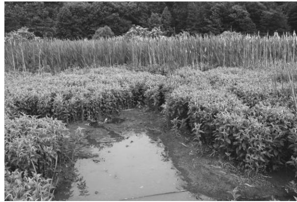
Fig. 1. Stands of lizard's-tail (foreground) and cattail frequented by a Black Rail in Huntley Meadows County Park, Fairfax County, Virginia, from 10 June to 13 July 2002.

I mapped the rail's territory on seven days, 22 June to 4 July, by tracking its vocalizations from the elevated boardwalk that winds across the floodplain of Barnyard Run with a global positioning system (GPS) receiver. The rail frequented a roughly circular area of marsh (ca.